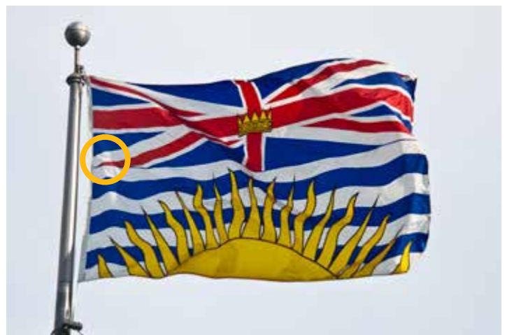
[K] Wider white stripe above red stripe nearest the flagpole