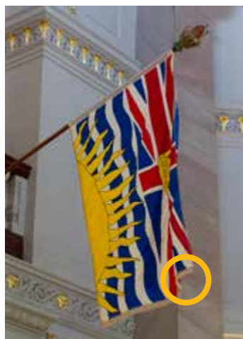
[J] Gold fringe