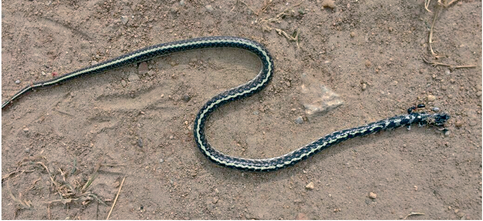
Fig. 1: Roadkill of Elachistodon westermanni REINHARDT, 1863, from between Gonor Village and the town of Chitradurga, State of Karnataka, India.

India (DANDGE & TIPLE 2016). Out of 20 available occurrence locations (Table 1), only two are from southern India, i.e., North