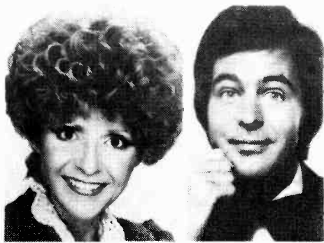
Brenda Lee & Jim Stafford: Talent Search

It must be the season to discover new talent. Wild Turkey held its contest last week, Opryland is hitting the road for an audition tour, and this week at the Grand Ole Opry House Brenda Lee and Jim Stafford will host the 1984 Wrangler Country Showdown.