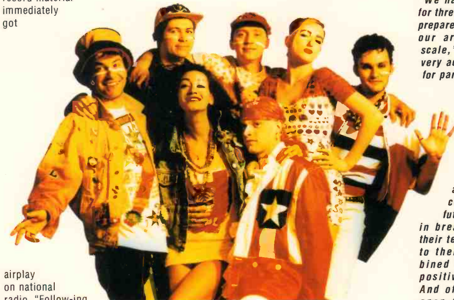
The Dinky Toys