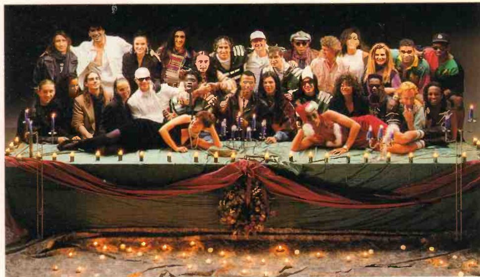
The Crea Stars

"We wanted to create a buzz, make the record jump out of the pack"