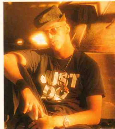
BC & The Basic Boom

Just like Confetti's before, the group WAMBLEE is aiming at a very young audience. Their Sioux-Indian roots and original approach on stage are the key ingredients of their success and the basics of their future career.