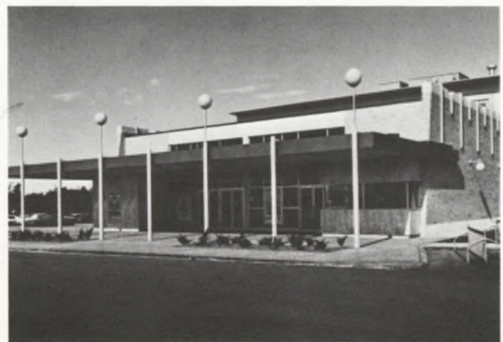
Northshore Theatre—Houston, Texas