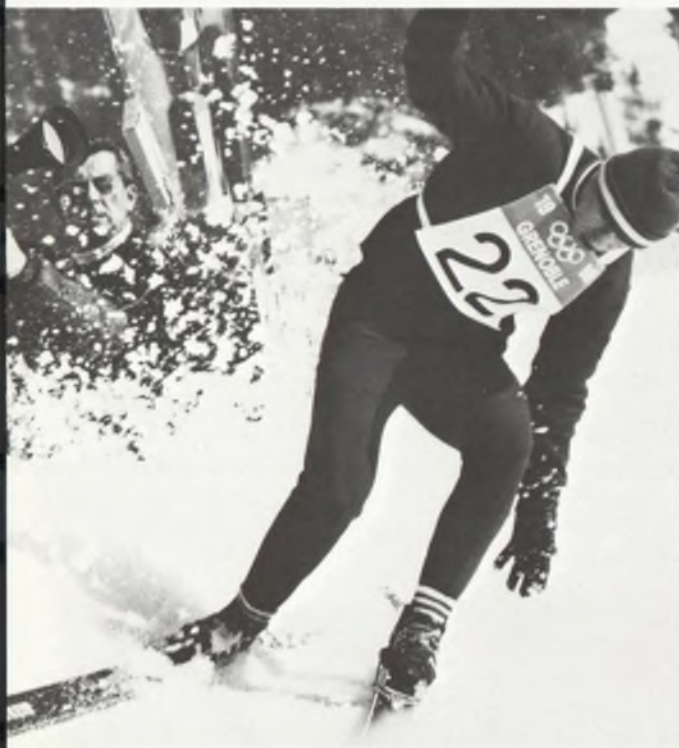
Exclusive on ABC, the Winter Olympics, telecast in color and via satellite, was the most ambitious sports production ever undertaken.