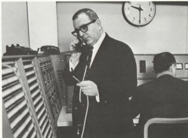
Display of news and sport personalities of the four radio network services and new technical facilities for the expanded radio network operations.