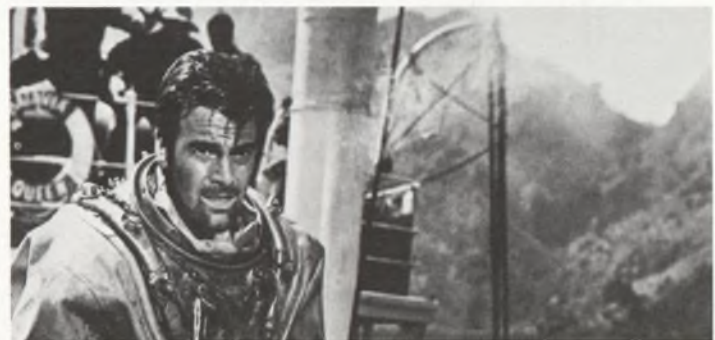
In Cinerama, "Custer of the West," starring Robert Shaw, and "East of Java," with an all-star cast headed by Maximilian Schell.