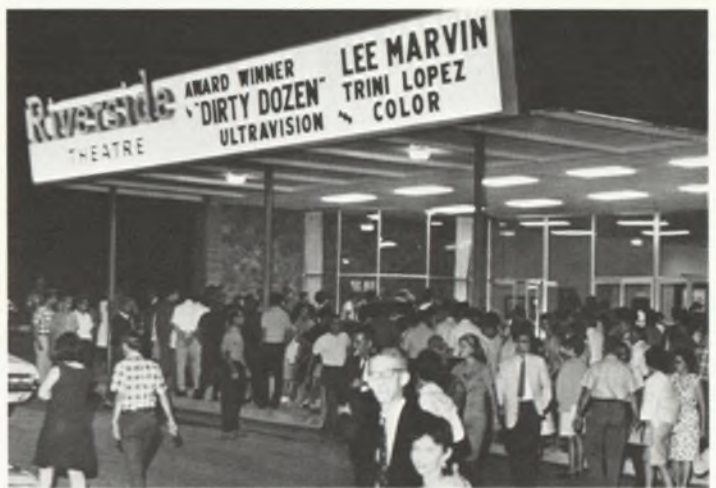
Riverside Theatre—Danville, Virginia