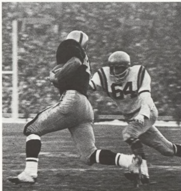
With innovations such as "split-screen instant replay" on NCAA football, ABC enhanced its position of creative leadership in sports.