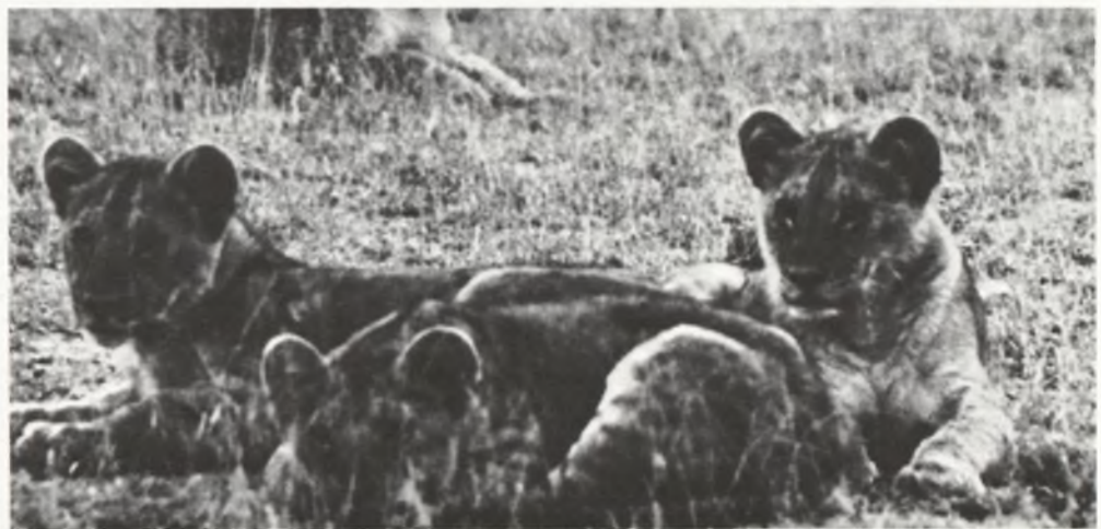
Recipient of the George Polk Memorial Award for outstanding television documentary, "Africa" was cited as "a milestone in television journalism."