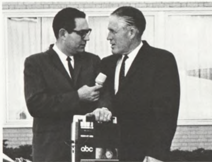
Governor George Romney's viewpoint on both local and national issues were sought by WXYZ Radio newsman in Detroit.