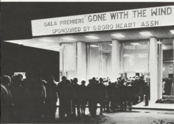
Terrace Theatre—Greensboro, N.C.