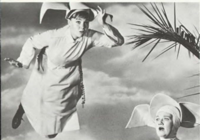
"The Flying Nun," with Sally Fields as the unorthodox novitiate, a warm and winning situation comedy.