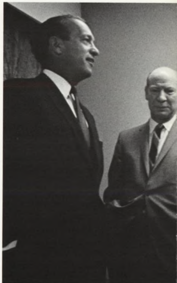
Leonard H. Goldenson President

Earnings per share are based on the average number of shares outstanding.