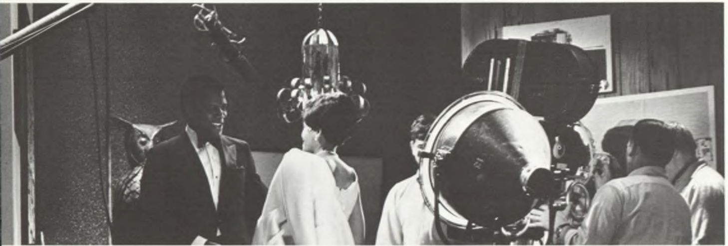
Sidney Poitier, currently the number one box-office star, is featured in the romantic comedy "For Love of Ivy."