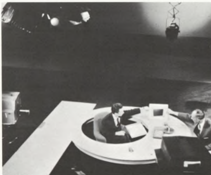
Program on CFTO-TV, Toronto, flagship station of the CTV Network of Canada and an associate of ABC International's Worldvision station group.