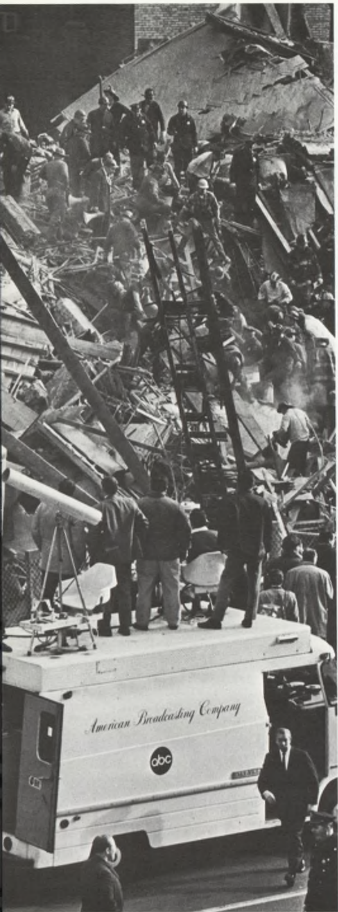
On-the-scene reporting by WABC-TV in New York, part of the comprehensive local news coverage by ABC Owned Television Stations.