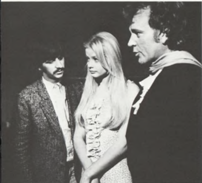
Ewa Aulin stars as "Candy," with an international cast including Richard Burton and Ringo Starr.