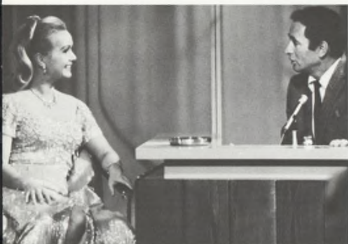
"The Joey Bishop Show," late evening entertainment drawing glamorous and talented guests like Debbie Reynolds.