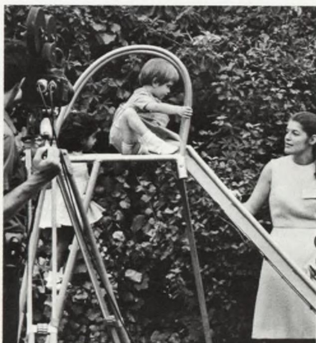
World of the deaf child, one of the many compelling subjects studied on news specials in 1967.