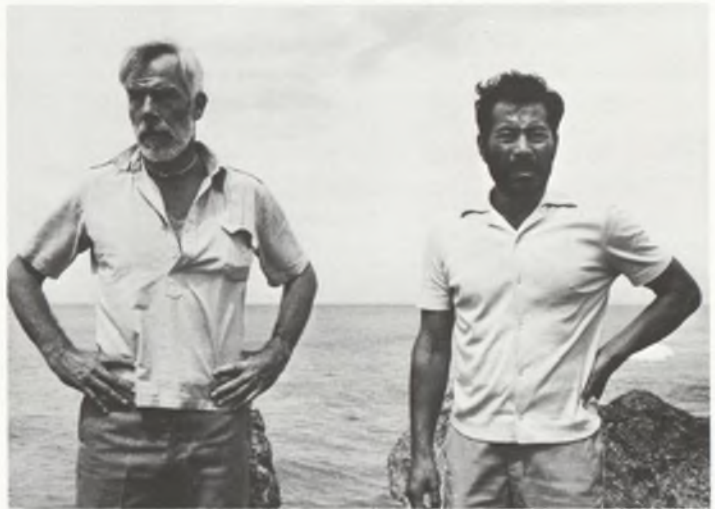
Two of the world's top male performers, Lee Marvin and Japan's Toshiro Mifune, star in "Hell in the Pacific."