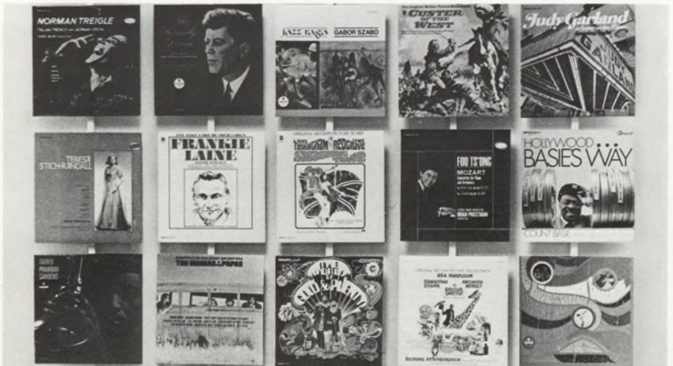
A selection of albums from ABC Records' catalogue of popular and classical recordings.

ABC, through a partly-owned company, has a 40% interest in five "Holiday on Ice" shows; two of these internationally popular ice shows tour the United States and other parts of the Western Hemisphere, two productions are primarily shown in major cities of Europe and the fifth show is touring the Far East and Australia.