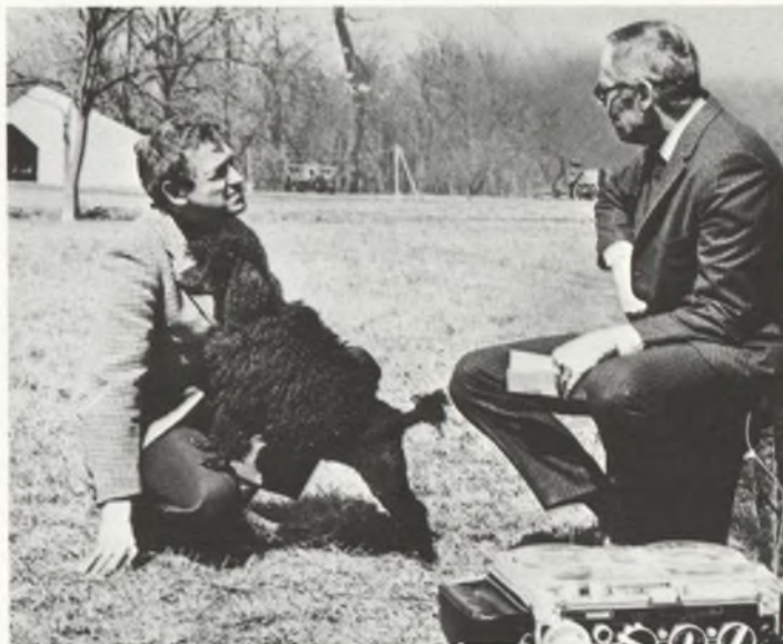
Special programs by the ABC Owned Television Stations included WBK B-TV's documentary on the American artist Andrew Wyeth, narrated by Henry Fonda.