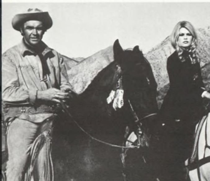
Sean Connery and Brigitte Bardot star in "Shalako," a western drama produced in Spain.