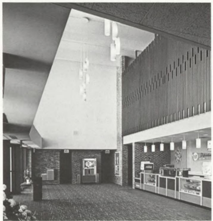
Hillcrest Theatre—Joliet, Illinois