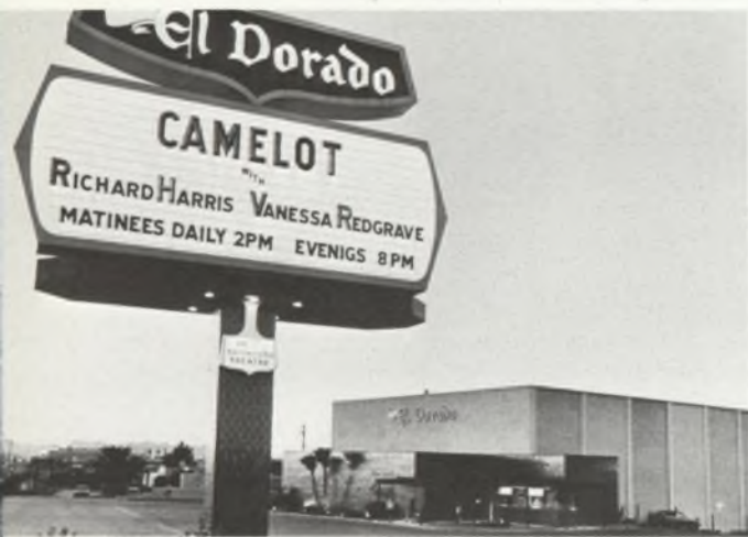
El Dorado Theatre—Tucson, Arizona

Among the new theatres operating in 1967—