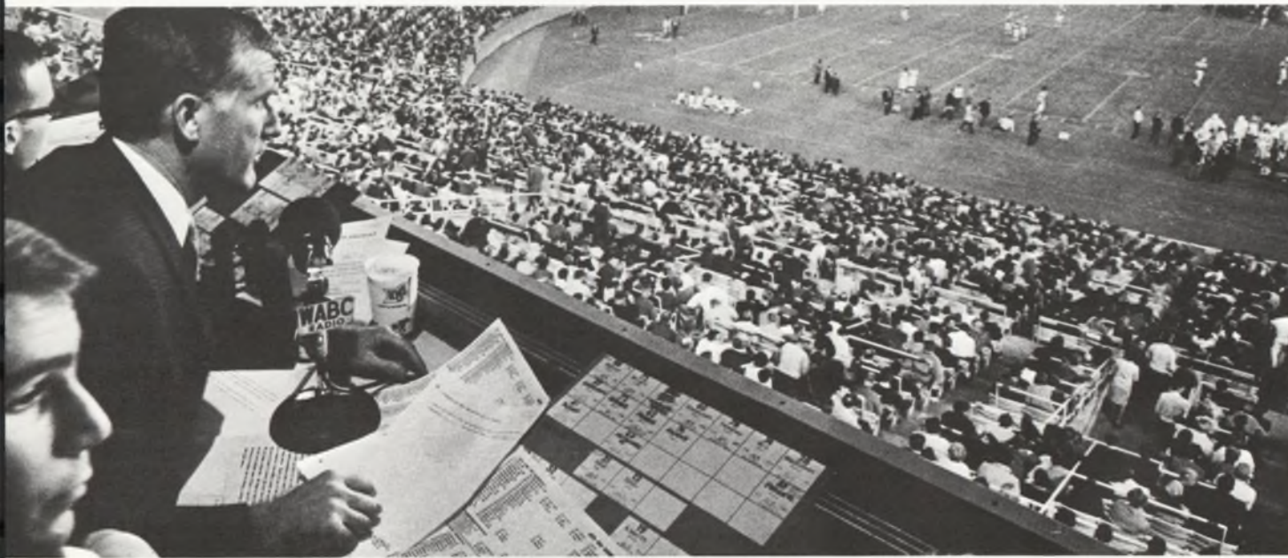
WABC Radio provides exclusive radio coverage of the New York Jets football games.