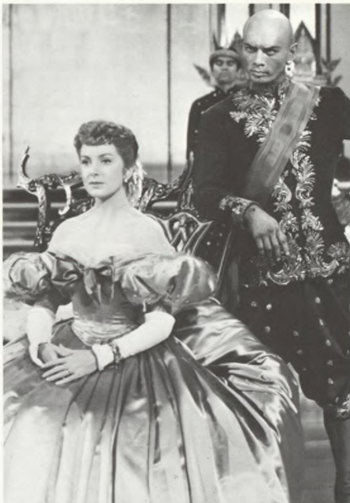
Among the important movies telecast was "The King and I," starring Yul Brynner in his Academy Award performance and Deborah Kerr.