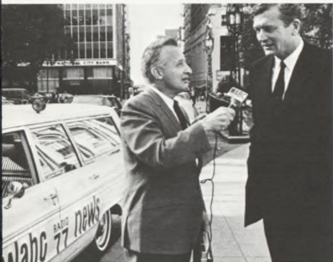
WABC Radio's reporter catches New York Mayor John Lindsay for a news comment.