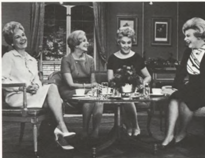
ABC Films' "Virginia Graham's Girl Talk," the long-running program now in its sixth year.