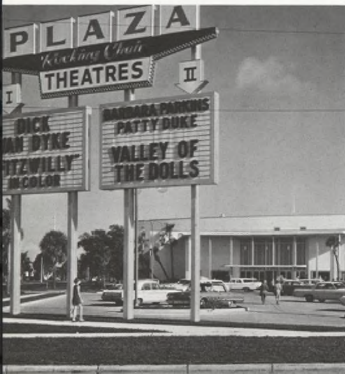
Plaza I and II Theatres—St. Petersburg, Florida