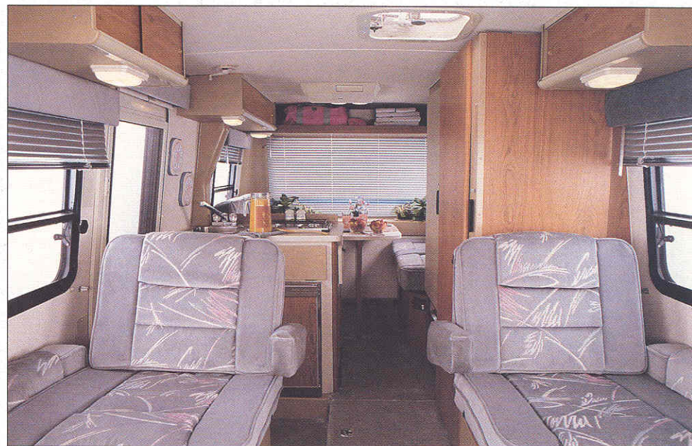
LeSharo's unique split level interior allows up to six feet of headroom. Stain resistant, automotive grade upholstery fabrics and plush carpeting adorn the beautiful Silver Streak decor.

Best of all, LeSharo is backed by Winnebago Industries' 30+ years of RV building experience and a 3 year/36,000 mile limited warranty, so you know it's dependable. Now what are you waiting for? Go out and test drive the most exciting motor home on the road today - the 1992 Winnebago LeSharo. If you're looking for an efficient, hard working vehicle with many talents, it's the perfect choice!