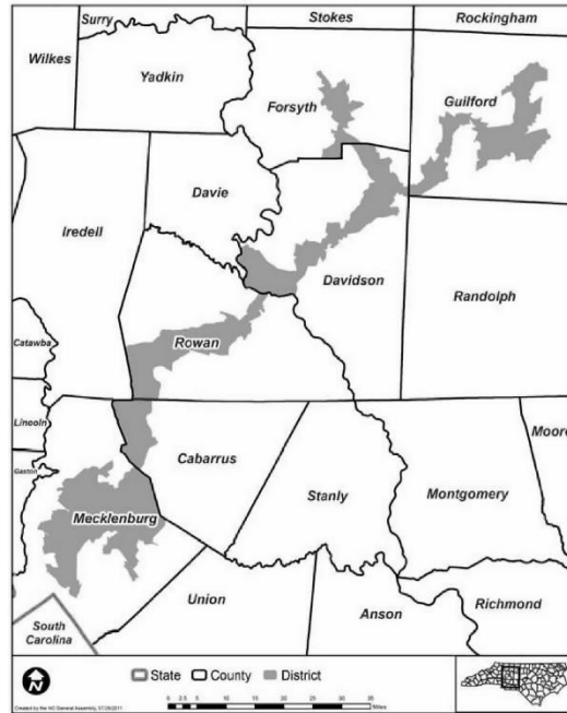
Congressional District 12 (Enacted 2011)

¶121 The United States Supreme Court described Congressional District 1 as "anchored in the northeastern part of the State, with appendages stretching both south and west[.]" Id. at 1456. It described District 12 as "zig-zagging much of the way to the State's northern border." Id. District 1 had a BVAP of 52.7% and District 12 a BVAP of 50.7%. Id. at 1466. Based on direct statements from a North Carolina Senate debate, the Court noted the map drawers had purposefully designed