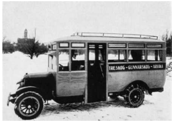
The first buses were not exactly beautiful—but they ran well.

pensate for the labour-saving automation and the lower tool costs per manufactured part which was possible in the larger series produced in the United States. We who founded Volvo thought that they would.