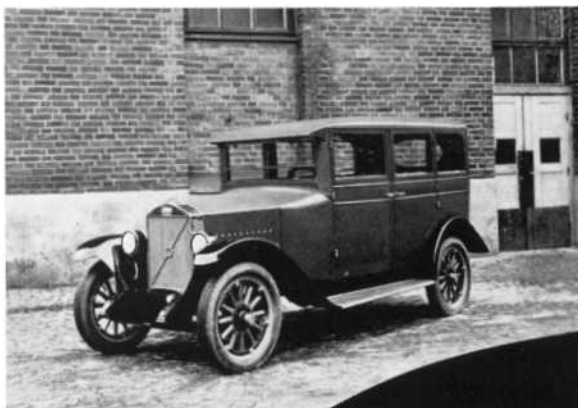
The PV 4—the first Volvo sedan with a leatherette-covered wooden body.

The most important of these was to build a Swedish automobile so economically that it would be able to compete with American automobiles. Mass production was, naturally, the solution. But since the market would be limited to Sweden, at least during the first few years, the rate of mass production possible could hardly be on the same scale as in the United States. The question was whether the low Swedish rates of pay could com-