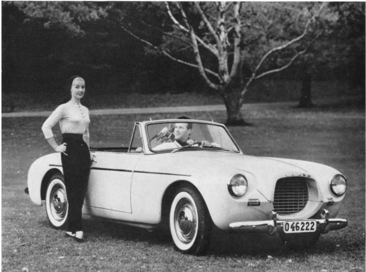
The Volvo Sport a plastic body which is now out of production.

sales side was not completely free from difficulties. It took a great deal of very hard work to create a sales organization for the excellent, robust but rather rural-looking automobiles-the first sedan we built described as likening a pregnant cow.