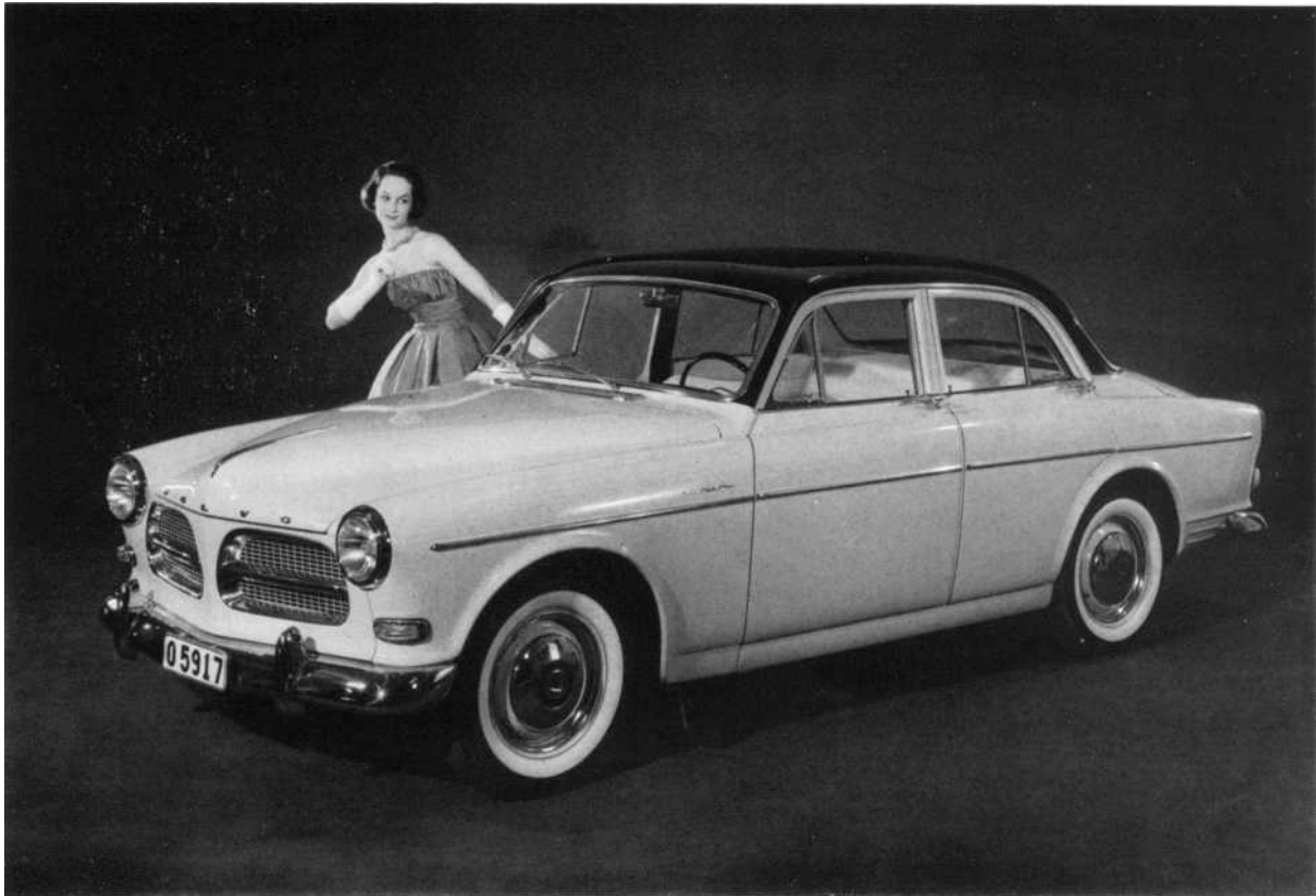
The four-door, five-seater Volvo 122 S.

ing abreast where manufacturing methods and styling are concerned. Opposed to this, or perhaps just because of it, the work is intensely stimulating. When we started and reckoned out that we should manufacture 8,000 vehicles the third year to ensure a profit-making organization, we showed ourselves to be too naive as far as the rate of development was concerned but unnecessarily pessimistic concerning the volume required in order to show a profit. In spite of this, for my own part, I have always considered through the years that the really important thing was to strive for increased productive volume while increased profits, or rather immediate profits, are of secondary importance. It seemed to me that through increased volume, the profit side would gradually be looked after. That is why when various occasions have risen causing conflict between a desire for profit and chances for increased production volume, my decision has usually been to the advantage of production volume. The more vehicles we had on the roads the easier they were to sell or, as one of our overseas agents expressed it: One customer won is ten customers won, one customer lost is ten lost. One absolutely clear subsidiary speculation in this argument is spare parts sales which were reckoned to follow in the track of vehicle sales and which,