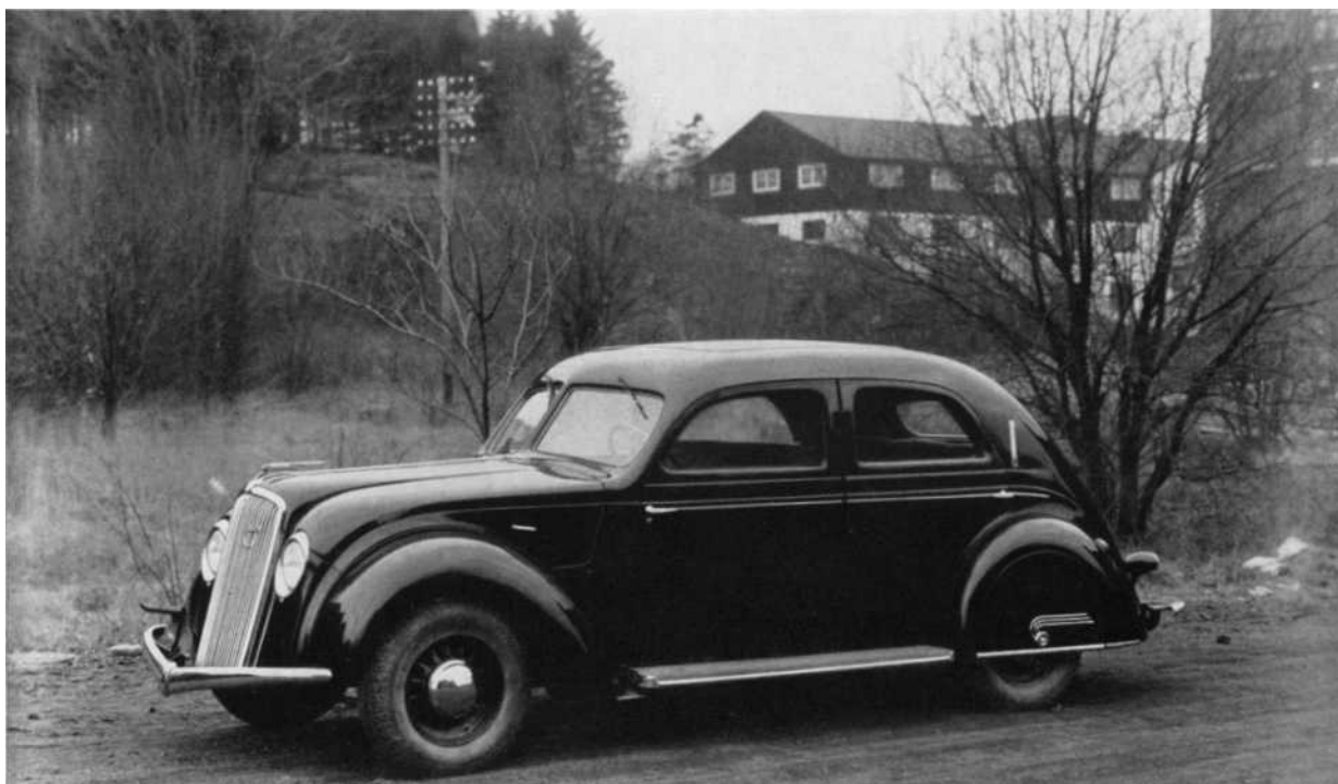
The first streamlined car-the PV 51 Carioca-made its appearance in 1936.

the United States, where they could learn the most modern manufacturing technique and use it in Sweden.