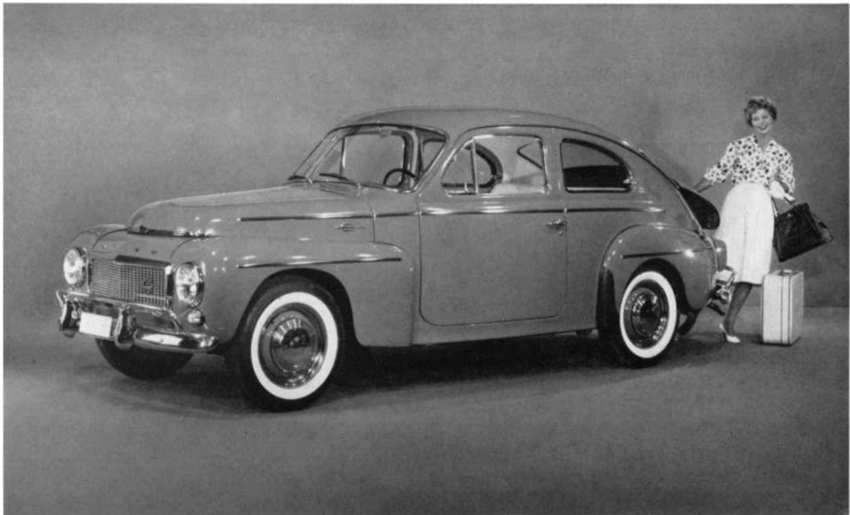
The PV 544 is in great demand in the United States.

later as people in general and experts in particular had an opportunity to see this automobile and even more important-to drive it.