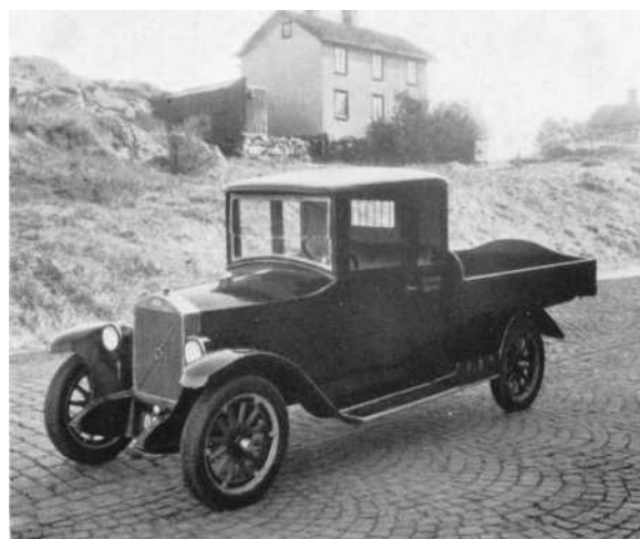
This truck from 1928 had a payload of 800 kg. (1,760 lb.)

A significant phase in our development was when we persuaded our Swedish sub-contractors to send technicians to foreign countries, primarily