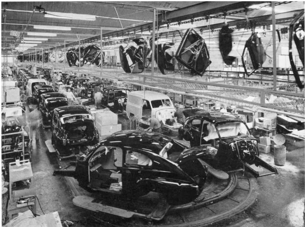
Assembling the Volvo PV 544. The car is ready to drive away one and a half hours from the time that the body from the spraying plant has been lifted onto the assembly line. The main line is supplied with complete sub-assemblies such as front and rear suspension units, balanced wheels, doors and the complete bonnet with front fenders, radiator, grill and headlights from separate feeder lines.

Even if purchasing and manufacturing problems were most complex during the first ten years, the