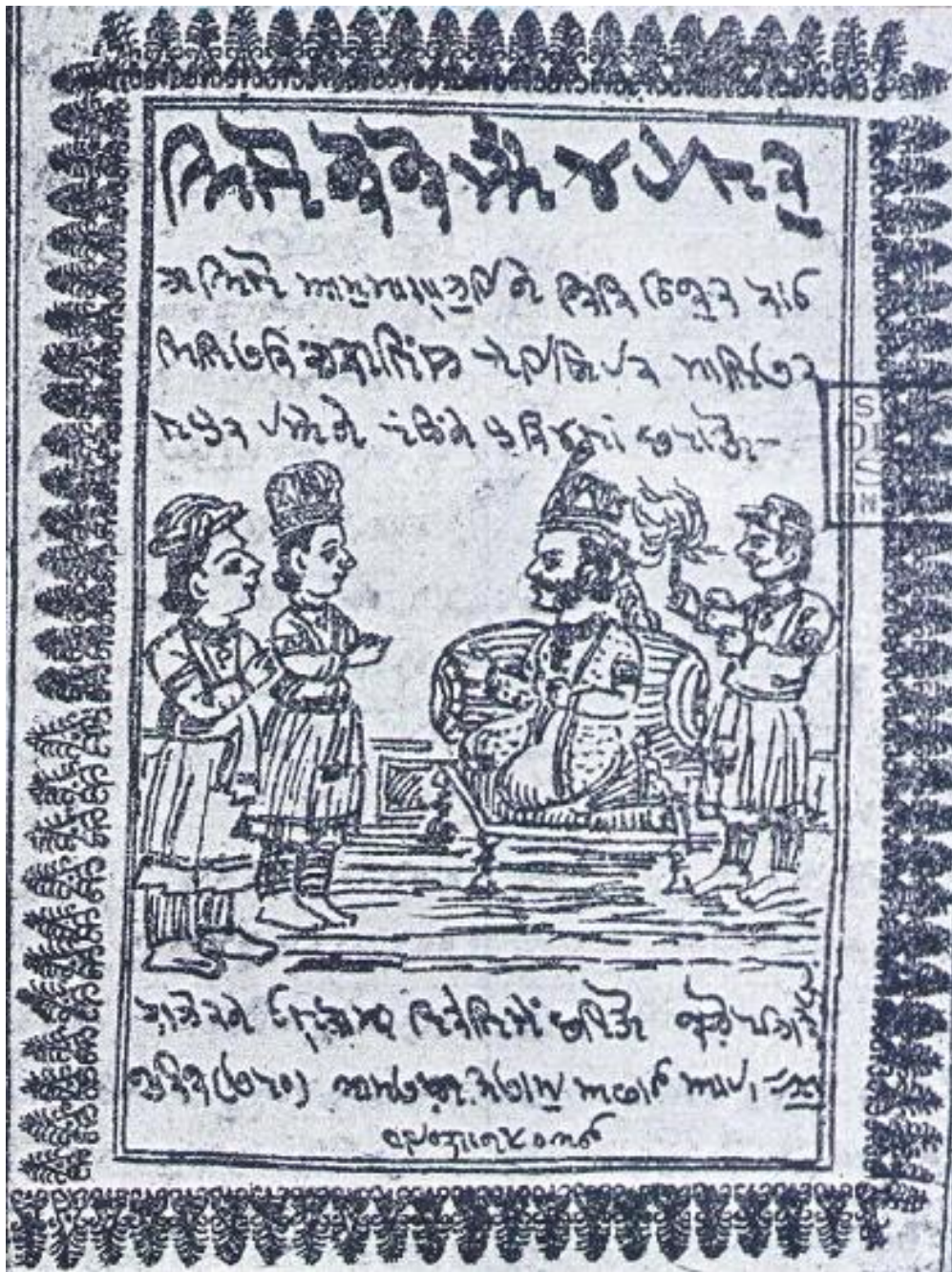
Figure 4: Cover of a book containing the epic Dodo Chanesar written in Standard Sindhi.