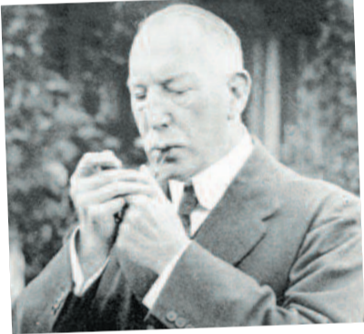
Sir James Craig, Carson's indispensable deputy during the Home Rule Crisis