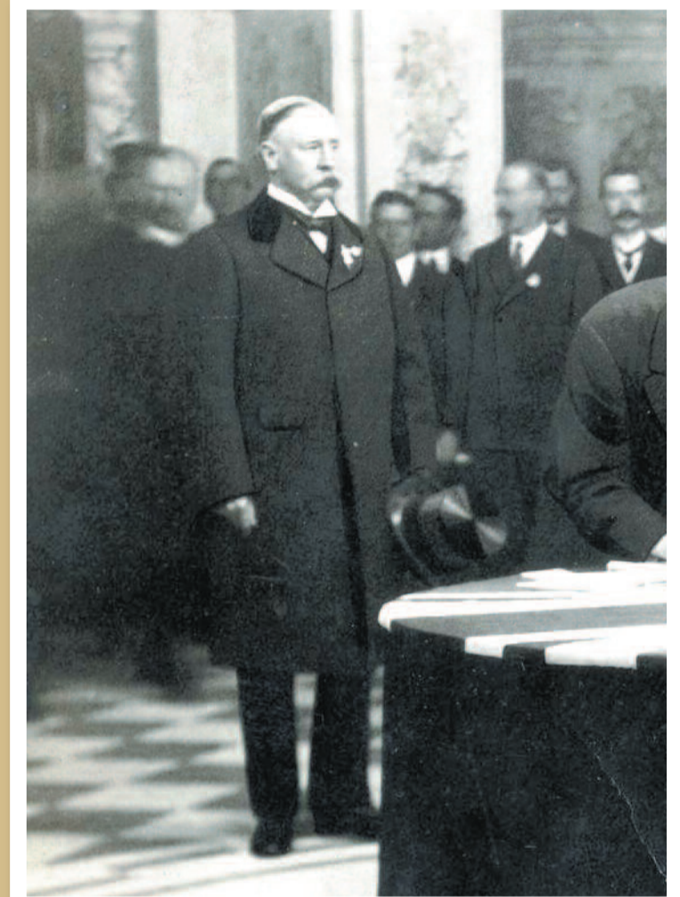
Sir Edward Carson signs the Ulster Covenant against the imposition of Home Rule.