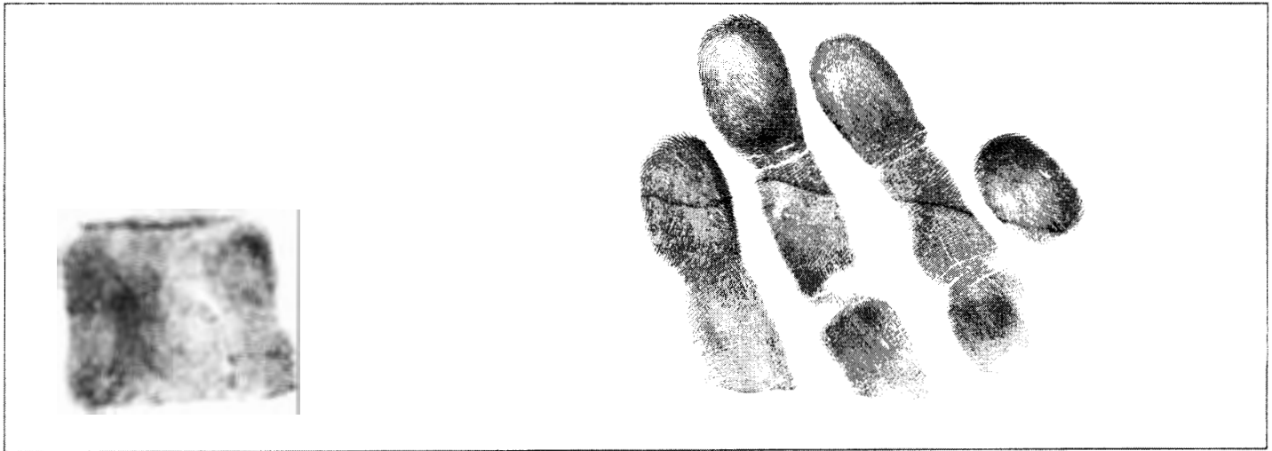
Defendant's Right Thumb