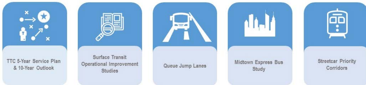
Figure 1 - Current Surface Transit Initiatives Supported by STNIS