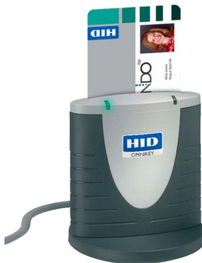
Figure 4: Omnikey CardMan 3121 USB CCID Smart Card Reader

sysmocom offers suitable USB CCID compliant card readers at https://shop.sysmocom.de/SIM/Card-Readers-Writers/