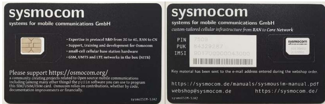
Figure 3: sysmoISIM-SJA2

The sysmoUSIM-SJS1 and sysmoISIM-SJA2 are Java SIM card with the following specifications and features: