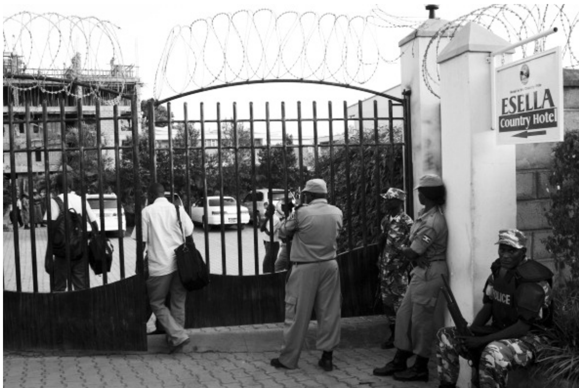
Police officers gather outside the Esella Country Hotel in Kampala, Uganda, on June 18, 2012, following a raid on a gay rights workshop.