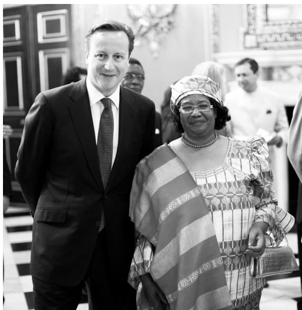
Former British Prime Minister David Cameron and Malawi President Joyce Banda at the Commonwealth Heads of Government lunch in London, June 6, 2012.