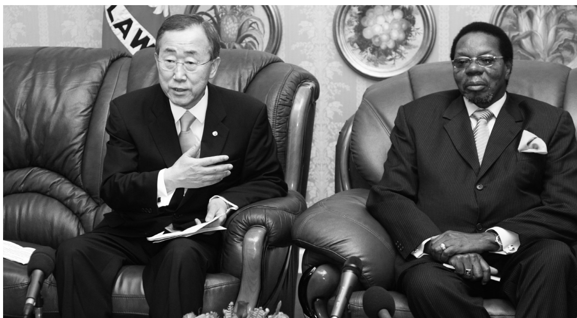
Malawi President Bingu wa Mutharika announces his pardon of an incarcerated gay couple following a meeting with United Nations Secretary General Ban Ki-Moon in May 2010.

interviewed in Zimbabwe and many in Uganda told PRA that their families took them to pastors to have their demons of homosexuality cast out. 29 Such beliefs can break up families. In Zimbabwe, we learned one family was convinced that their suffering was due to their 17-year-old daughter being a lesbian. Because the family believes her demons will continue to impoverish and trouble them, they see nothing wrong in physically abusing her. Due to criminalization of homo-sexuality, the girl cannot seek protection from the police for fear of arrest, but is in no position to leave her family's home. 30