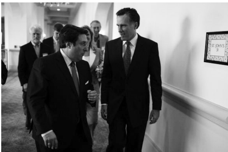
Jay Sekulow of the American Center for Law and Justice with 2012 Republican President candidate Mitt Romney (R-MA) in 2007, consulting during Republican Party meetings around 2008 presidential nominations.

by law enforcement and public officials, as the International Gay and Lesbian Human Rights Commission (IGLHRC) showed in its 2011 report, “Nowhere to Turn: Blackmails and Extortion of LGBT People in Sub-Saharan Africa.” As the criminalization of LGBT people forces them to keep their “sexual orientation and gender identity secret for fear of prosecution, violence, and other persecution,” the result is that