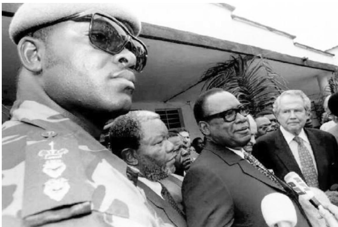
President Mobutu Sese Seko of Zaire (third from left) and Pat Robertson, U.S. evangelical minister (right) in Kinshasa, Zaire (now the Democratic Republic of the Congo), 1995.

anti-discrimination ordinances that include sexual orientation. 63 (see profile)