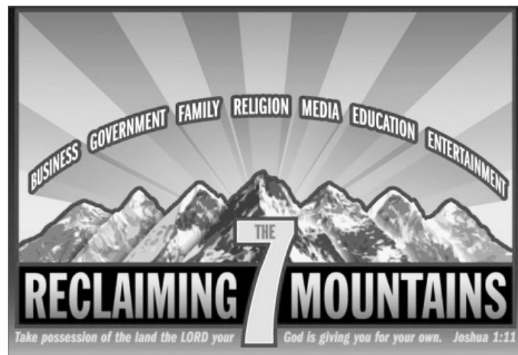
The Seven Mountains Mandate, part of the International Transformation Movement, promotes Christian evangelicals taking “dominion” over the pillars of society.

The Transformation campaign emerged within the past ten years from the neo-Pentecostal sector of Christianity and has played a significant role in promoting the ideology of the apostolic and prophetic movement also known as the New Apostolic Reformation (NAR), which advertises itself as the most dramatic change to Protestantism since the Reformation. NAR believes in the Seven Mountains Mandate, which states that God has appointed Christians to “take over” the “seven mountains” or spheres of society: “business, government, media, arts and entertainment, education, the family and religion.” 21 [See profile]