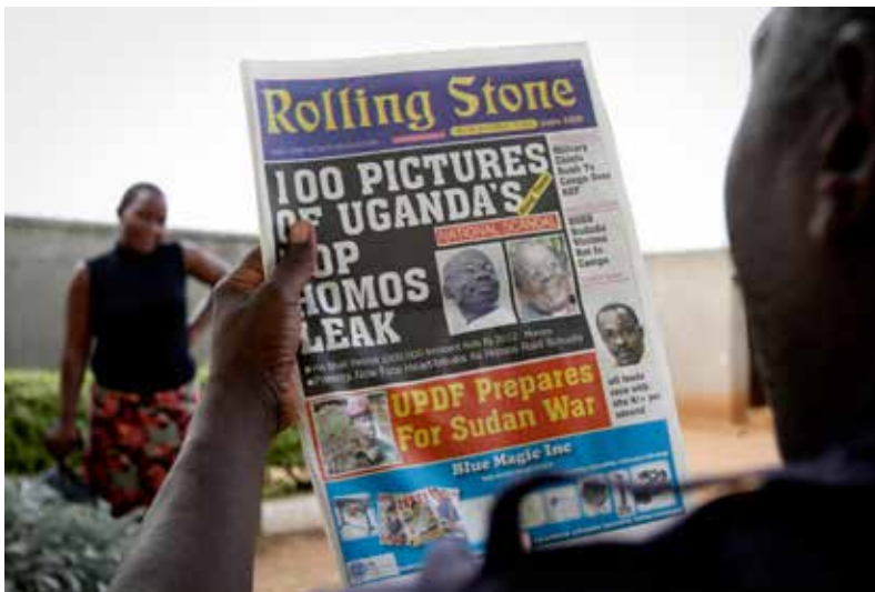
In Uganda, the Rolling Stone newspaper published the names, addresses and photos of 100 gay men in 2010 with a bright yellow banner that read “Hang Them.” Twenty-three days later, an LGBT activist on the list was murdered in his home.