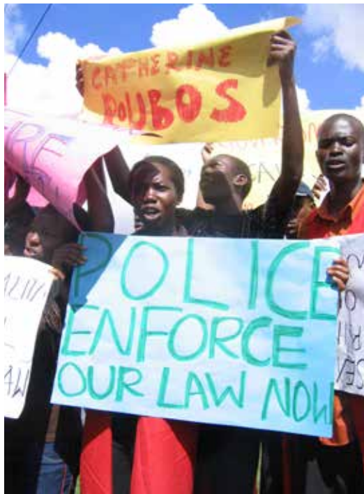
Belize is a hotbed of anti-gay hatred, partly the result of propaganda spread with the help of U.S.-based Christian Right groups.

Though the group's role in Belize is absent from its website, the ADF, like many prominent American religious-right groups, has supported criminalization in the past in this country. In the 2003 Lawrence v. Texas case, the ADF submitted an amicus brief supporting the