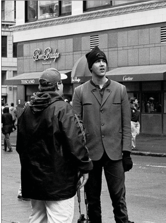
Novoselic during the WTO demonstrations in Seattle in 1999. He was outraged by the vandalism he observed.

Novoselic: Absolutely. And again it just has to do with your personal safety. I went to Croatia in 1993 and I saw the bomb-craters and the misery, the fear, the anger. And that happened when the rule of law collapsed. Then there was a vacuum, and people took the matters into their own hands. It's a downward spiral. It just gets really ugly. We can't say that it can't happen here, because it could happen anywhere.