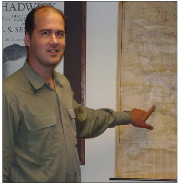
While doing research at the State Archives in 2005, Novoselic points to Grays River in Wahkiakum County, where he lives.