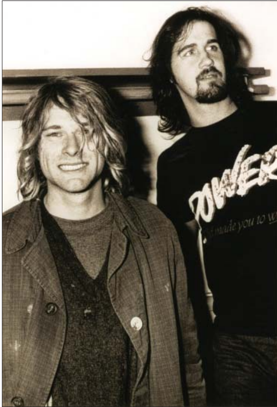
Kurt Cobain and Krist Novoselic pose in their dressing room backstage at the Paramount Theatre in Seattle after Nirvana's performance on October 25, 1991. Their landmark album "Nevermind" made its debut that week.

local Seattle media news, we made number one record. It was a lot of fun. Again things were just happening so fast so it was just part of the whirlwind.