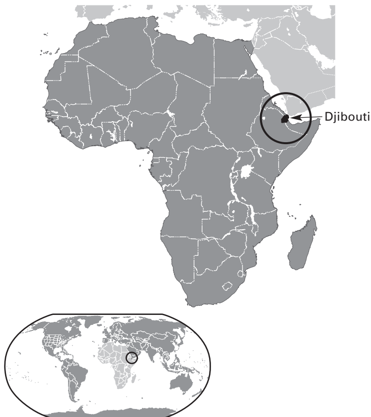
Figure 1.1 Location of Djibouti Map