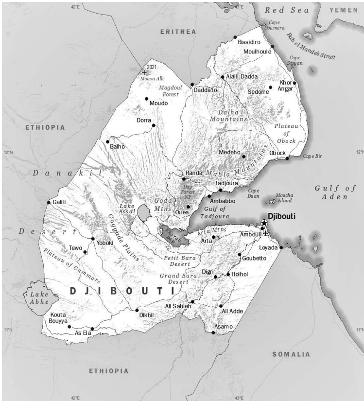
Figure 1.2 Map of Djibouti