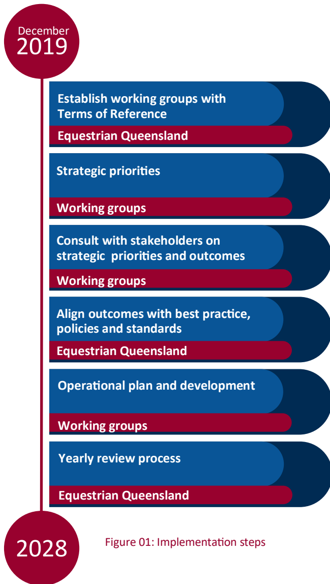
Figure 01: Implementation steps