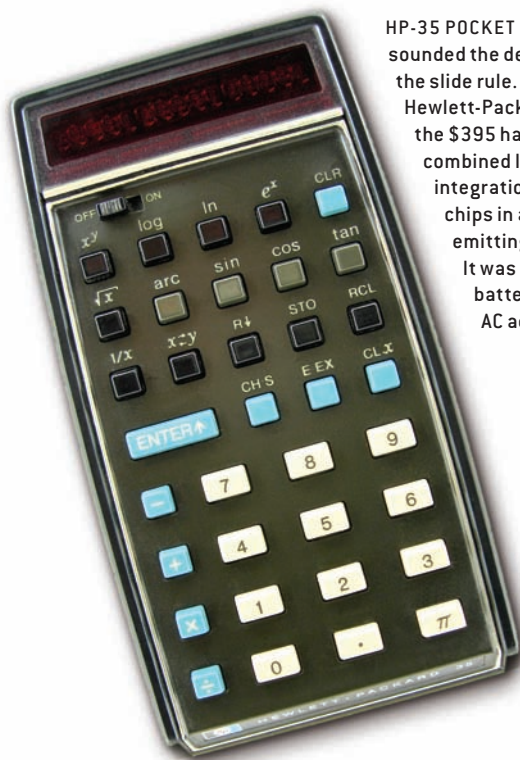
HP-35 POCKET CALCULATOR sounded the death knell for the slide rule. Introduced by Hewlett-Packard in 1972, the $395 handheld device combined large-scale integration circuits (six chips in all) with a light-emitting diode display. It was powered by batteries or an AC adapter.

Today an eight-foot-long Keuffel & Esser slide rule hangs on my wall. Once used to teach the mysteries of analog calculation to budding physics students, it harkens back to a day when every scientist was expected to be slide-rule literate. Now a surfboard-size wall hanging, it serves as an icon of computational obsolescence. Late at night, when the house is still, it exchanges whispers with my Pentium. “Watch out,” it cautions the microprocessor. “You never know when you’re paving the way for your own successor.”