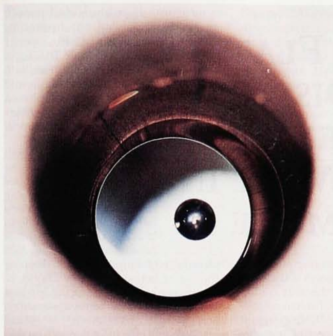
FIGURE 3: WEIGHTLESS FLUID DYNAMICS is one area in which research might exploit magnetic levitation, as exemplified by this hovering globule of water.

found an abnormal development of frog embryos in artificial microgravity, they probably rightly attributed it to the influence of weightlessness rather than to the magnetic field.