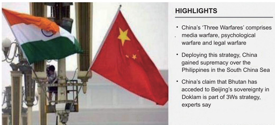
Figure 3. Is China Playing out Its 'Three Warfares' Strategy against India?