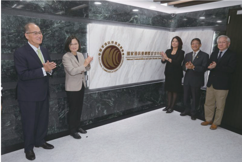
Figure 6. President Tsai Ing-wen is Inaugurating the National Communications and Cyber Security Center