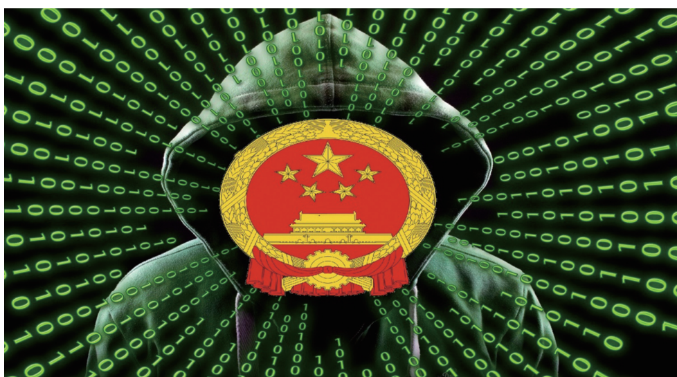
Figure 2. The New Digital War for Three Warfares