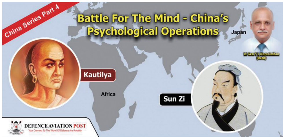
Figure 4. Battle For The Mind- China's Psychological Operations

Source: Lt Gen S. L. Narasimhan, "Battle For The Mind-China's Psychological Operations."