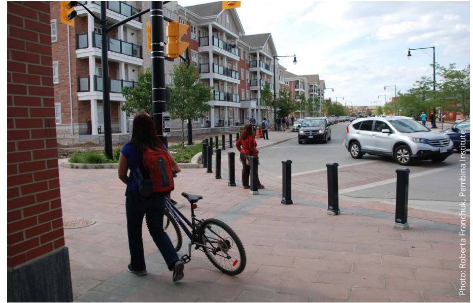
At 21%, Mount Pleasant station has one of the highest walking mode shares.