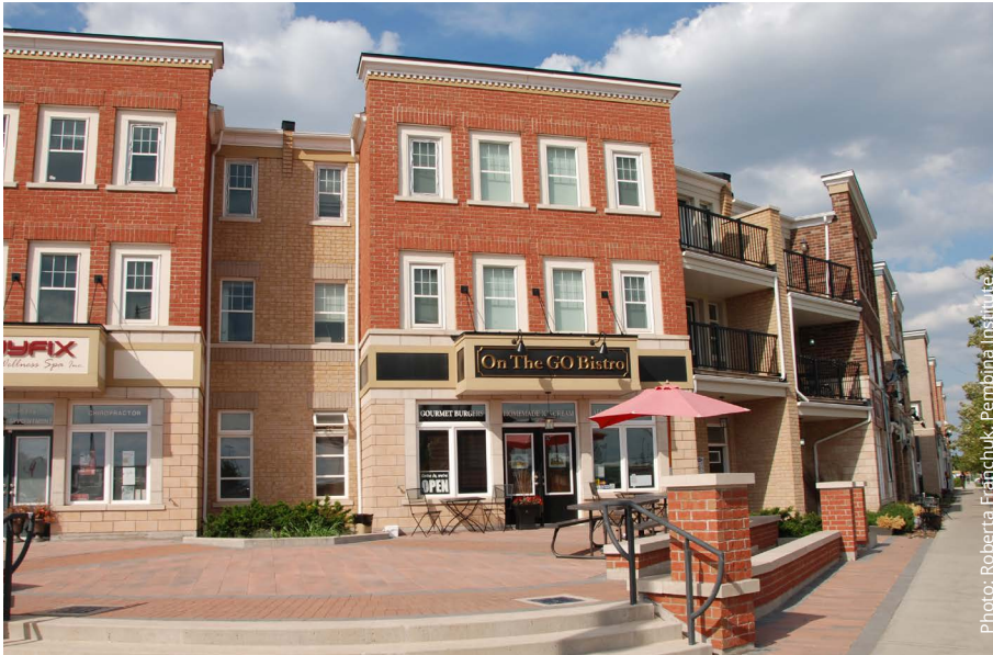
Mount Pleasant Village has a number of live/work units.