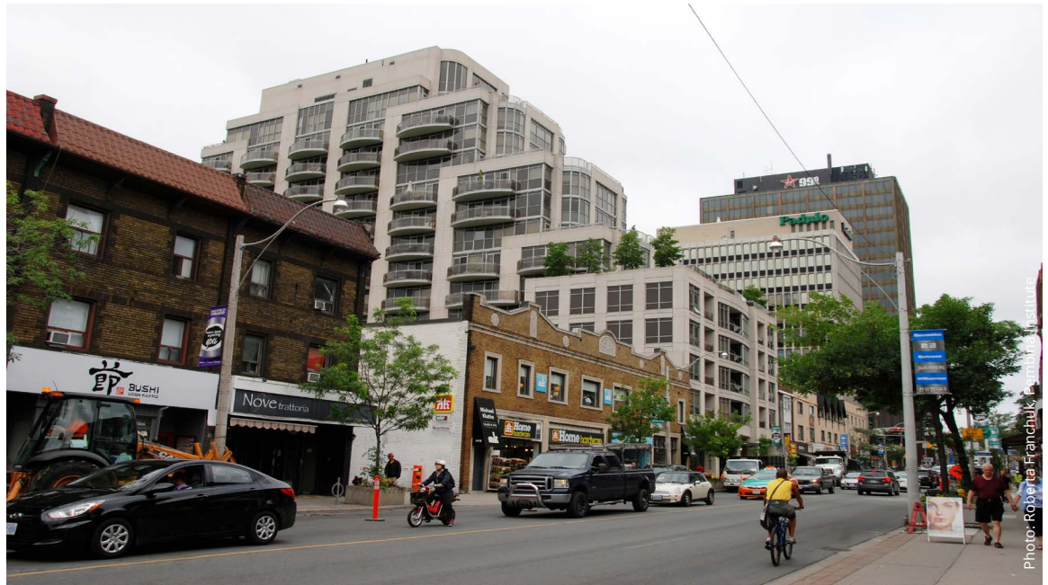
St. Clair Avenue in Toronto has a variety of housing options.

A great example of this is Eglinton Avenue: the future Eglinton Crosstown corridor paired with the official plan's demarcation of Eglinton as an "avenue" 9 acted as a catalyst for redevelopment and intensification along the corridor. Markham and Mississauga have also designated hubs and corridors to focus growth along major transit routes such as Highway 7 in Markham and Hurontario in Mississauga.