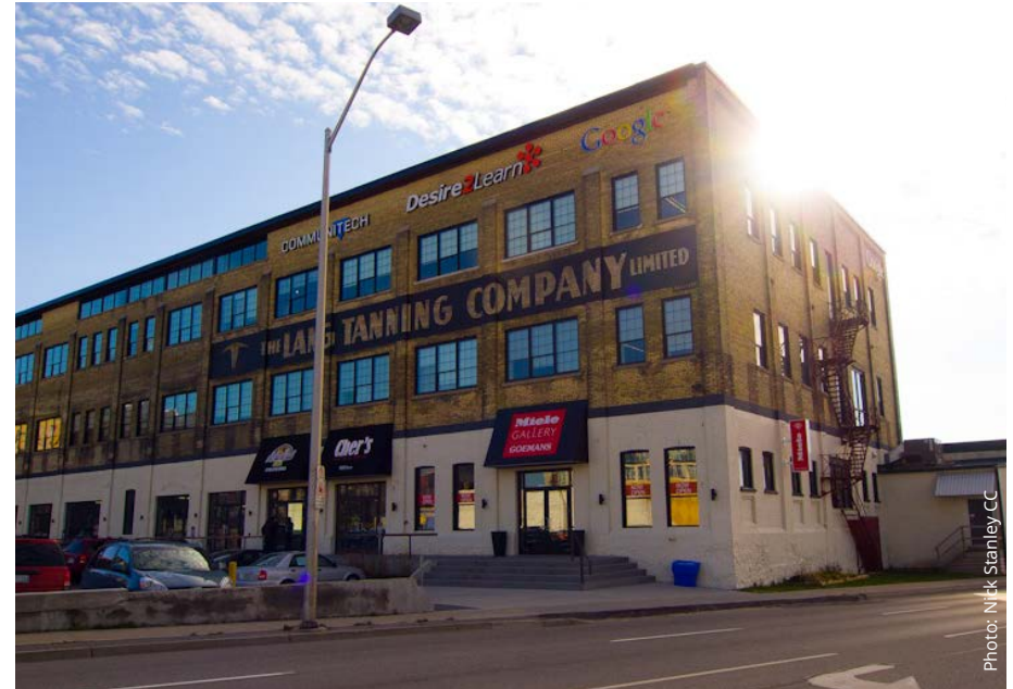
The Communitech technology innovation hub runs out of the Tannery.