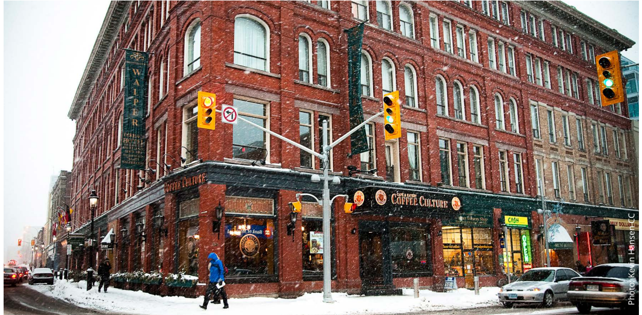
King Street in Kitchener.

A series of key events supported this shift. Close to a decade ago, the Neptis Foundation completed a study that included a comparison of development in urban centres across the GGH. 15 Downtown Kitchener was the slowest growing urban growth centre with the lowest population increase from 1996 to 2001. Neptis reported that although there were many opportunities to redevelop in downtown Kitchener, there was no market demand for living downtown.