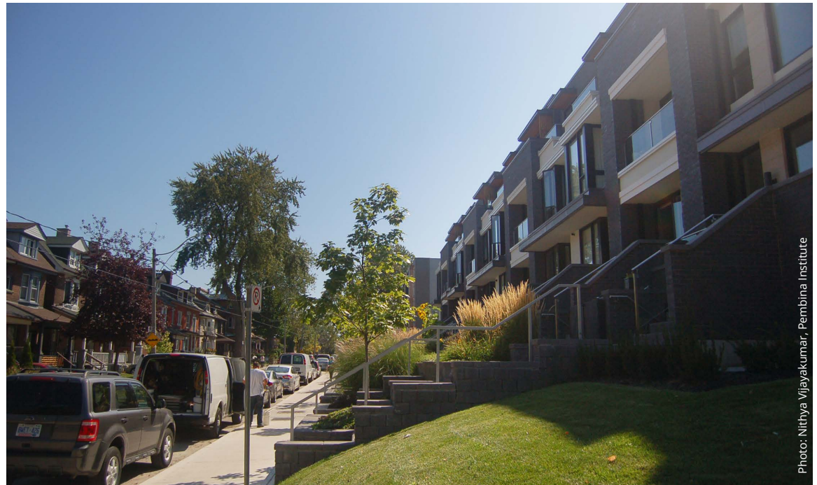
Townhouses on Shaw Street in Toronto.

These neighbourhoods make better use of land and have a greater mix of uses, which makes them more liveable. When homes and businesses are spread out, the same area wouldn't have enough density to support a greater range of amenities.