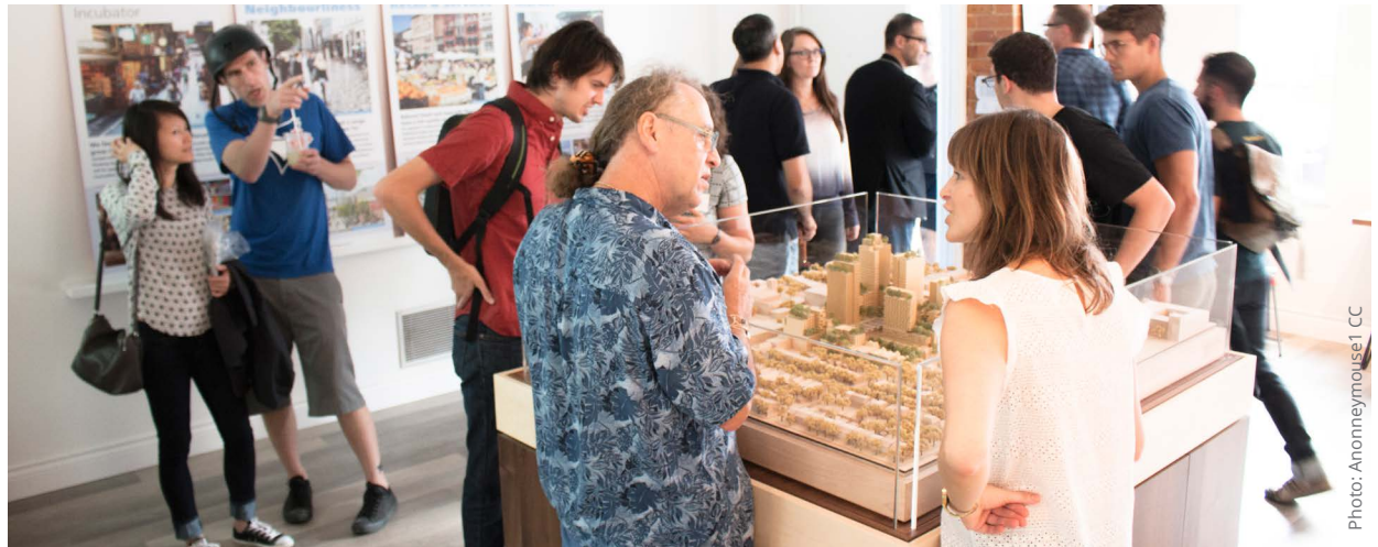
The Markham House will be open four days a week to gather community feedback on the Mirvish Village project until construction begins.

This case shows that fostering relationships between stakeholders and developers gets positive results and creates a win-win situation. When developers actively seek to listen, learn and accept community feedback, they earn trust within the community. Further, when communities positively engage with developers and seek common goals, the resulting development better benefits the community.