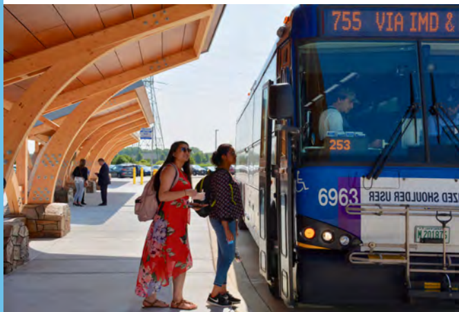
Riders board Route 755, which serves UIC and the Illinois Medical District, at the Pace Park-n-Ride Plainfield.