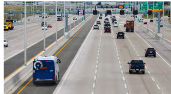
An I-90 Express Bus uses the Flex Lane while driving through Schaumburg.