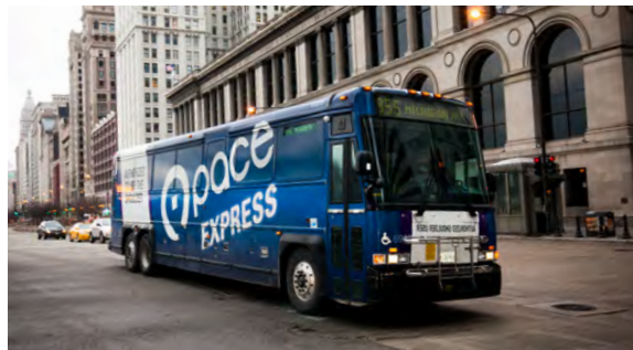
An I-55 Express Bus travels down Michigan Ave. in Downtown Chicago.

Route 606 parallels Route 600, but makes local stops west of Elmhurst Rd. Likewise, Route 616 makes local stops south of Arlington Heights Rd.