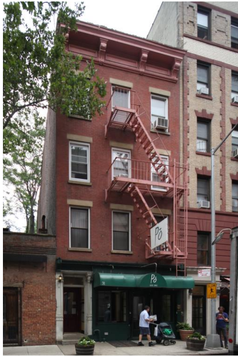
Figure 8: The former Caffe Cino, 31 Cornelia Street, New York City, New York, 2010.

The LGBTQ community has had a disproportionately significant and immeasurable impact on the cultural life of Greenwich Village and all of New York City, particularly in its theaters, which have featured the work of LGBTQ actors, directors, playwrights, and the various associated professions, as well as performers in its cafes and clubs, and as patrons of all of these venues. In the 1950s, Greenwich Village and the East Village became the cradle of what became the off-Broadway and off-off Broadway theater movements. The former Jaffe Art Theater, one of the most tangible reminders of the heyday of Yiddish theater in twentieth-century New York, was particularly renowned as the Phoenix Theater from 1953 to 1961. Founded by Norris Houghton and T. Edward Hambleton, it featured the work of directors including Tony Richardson and such performers as Montgomery Clift, Will Geer, Farley Granger, Eva Le Gallienne, and Roddy McDowall. 53 Actress-manager Julie Bovasso, in 1955, established and directed the Tempo Playhouse in the East Village, where she is credited with the American premieres of works by Jean Genet, including The Maids , as well as Gertrude Stein's In a Garden and Three Sisters Who Are Not Sisters . 54