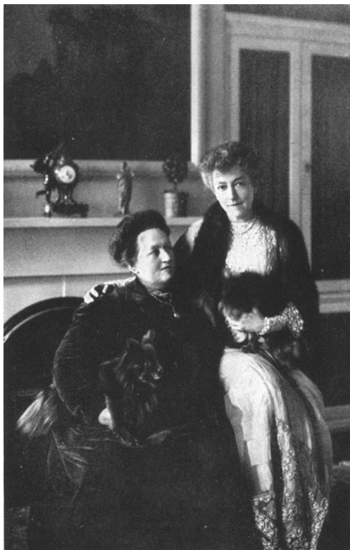
Figure 5: Elsie de Wolfe and Elisabeth Marbury. 29

On the opposite side of the social spectrum were a number of LGBTQ individuals who operated within the spheres of upper New York society, politics, and culture. The Victorian lesbian power couple Elsie de Wolfe, often credited as America’s first professional interior designer, and Elisabeth Marbury, one of the world’s leading, and pioneering female, theatrical producers (Figure 5), lived in a house near Union Square between 1892 and 1911. They first met in 1887, and their relationship lasted nearly forty years. Their Sunday afternoon salons