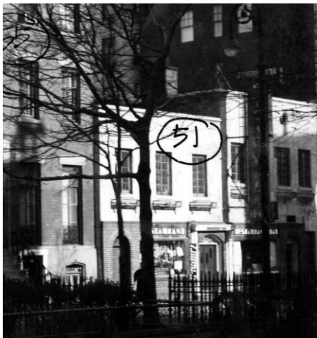
Figure 3: The Stonewall Inn, 51-53 Christopher Street, New York City, New York. Photo by John Barrington Bayley, circa 1965. Courtesy of the New York City Landmarks Preservation Commission.

Historic Landmark (NHL). 17 The designation did not happen at this time for two reasons: the lack of building owner support which was necessary in order to proceed, and the lack of precedence. Since there had never been any prior LGBTQ NHL historic context or theme study developed, the Department of the Interior deemed it impossible to determine the Stonewall's significance. Further, the successes of the gay rights movement were seen as too recent and too limited at that point; a street riot was questioned as the most worthy site for commemoration; Stonewall was not considered a defining moment or event for the LGBTQ