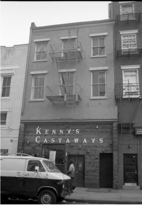
Figure 4: Former location of The Slide, 157 Bleecker Street, New York City, New York, 1980s.

space has been destroyed, the basement, along with the rest of the hotel, survives. 23