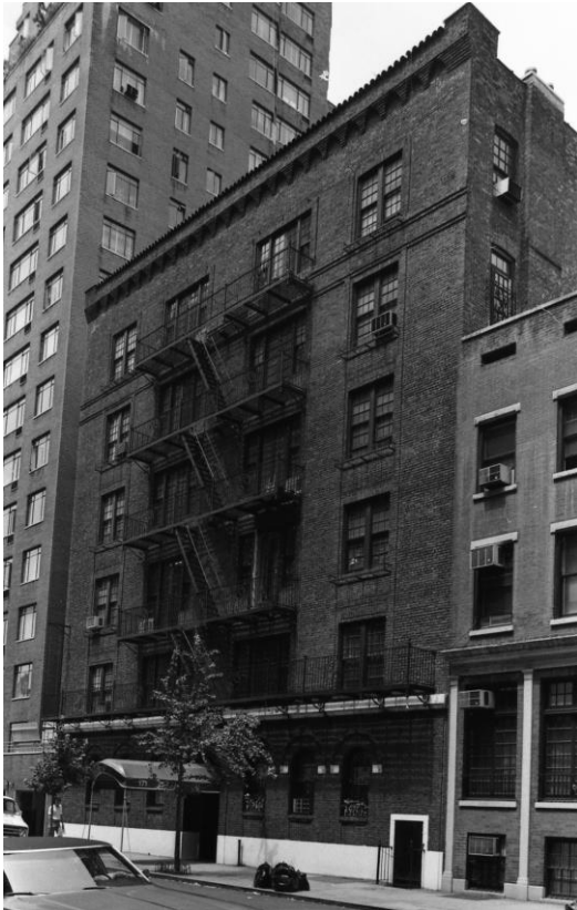
Figure 7: Apartment building, 171 West 12th Street, New York City, New York. Photo by John Barrington Bayley, c. 1965. Courtesy of the New York City Landmarks Preservation Commission.

1950-1972) was one of the places listed in a 1955-1956 FBI investigative report of “notorious types and places of amusement” in the Village that stated “A majority of the bars and restaurants in this area cater to lesbians and homosexuals, quite a few of whom reside in the area and are not inhibited in the pursuit of their amorous conquests. In the bars and