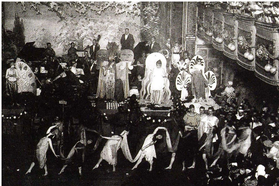
Figure 6: Masquerade ball in the 1910s or 1920s at Webster Hall, 119-125 East 11th Street, New York City, New York. 40