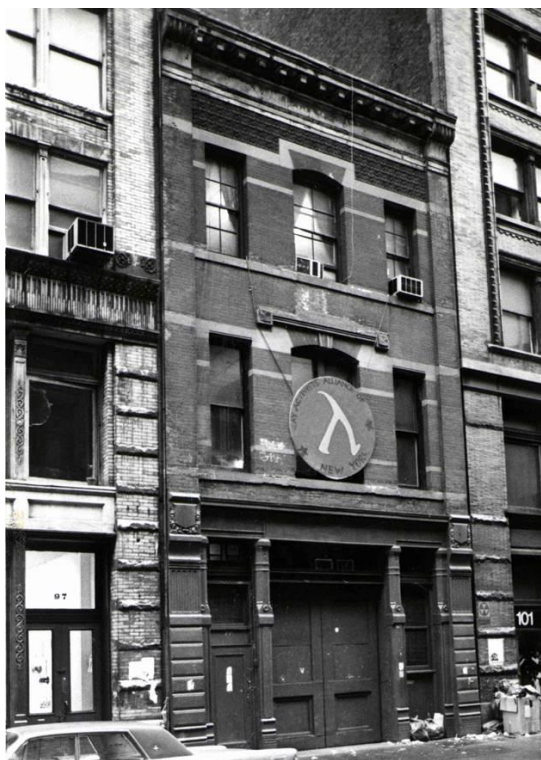
Figure 9: Gay Activists Alliance Firehouse, 99 Wooster Street, New York City, New York.

In the immediate aftermath of Stonewall, one of the earliest organizations formed was the Gay Liberation Front (GLF). Though of brief duration, the Gay Community Center was located (c. 1970-1971) on West 3rd Street (formerly Tony Pastor's Downtown). GLF had Sunday meetings and dances here, and this was also the headquarters of Radicalesbians, spun off of the male-dominated GLF in 1970, and the meeting place of Gay Youth, for GLF members under the age of eighteen. 60 A former firehouse in SoHo served as the headquarters of Gay Activists Alliance (GAA) (Figure 9) in 1971-1974. Formed in 1969 when a number of members broke away from the more radical GLF, GAA was primarily a