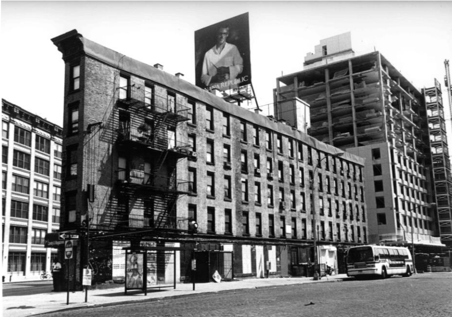
Figure 10: 669-685 Hudson Street building, New York City, New York, 2003.

Numerous LGBTQ notables in the arts have continued to reside and work in the Village. The Merce Cunningham Dance Studio, one of