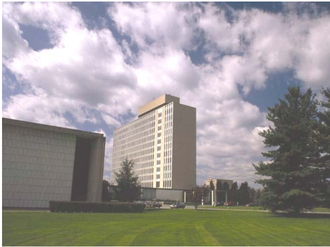
NIST Gaithersburg, Maryland