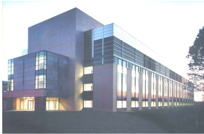
Advanced Chemical Sciences Laboratory