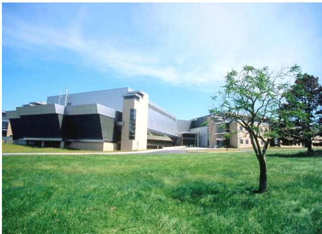
Advanced Measurement Laboratory