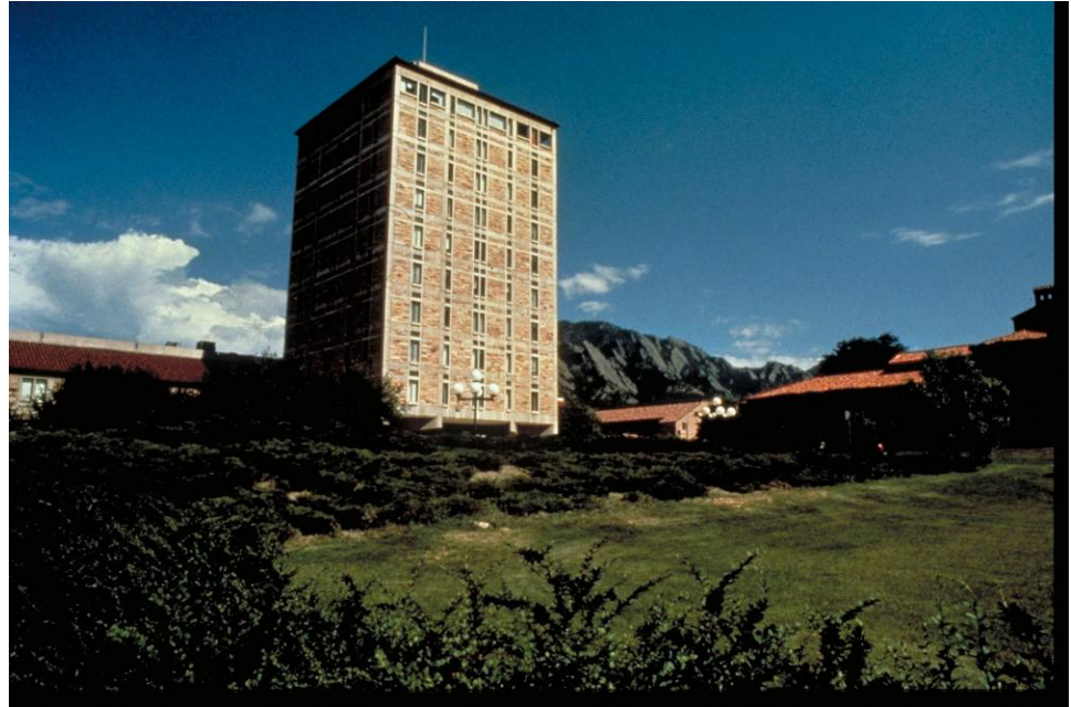
JILA – University of Colorado