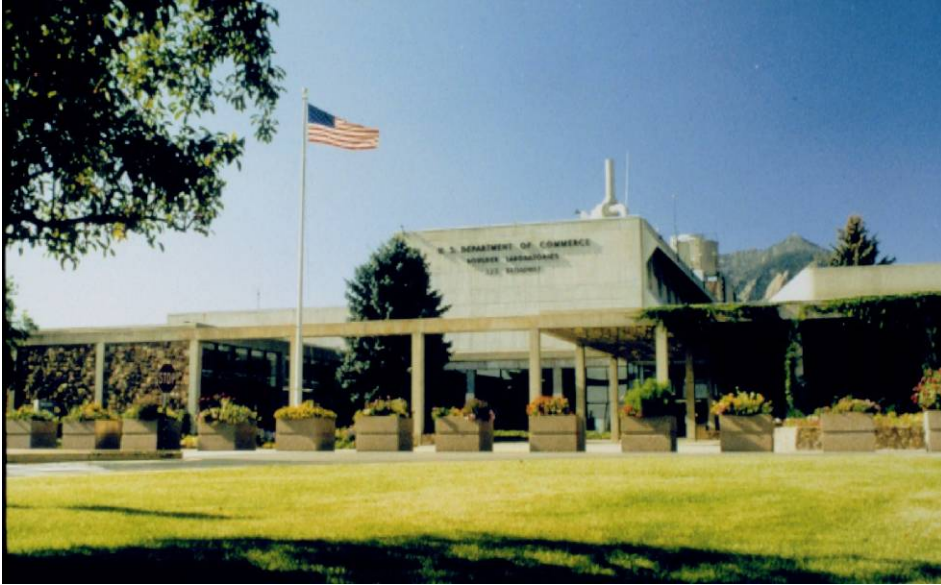
NIST Boulder Laboratories