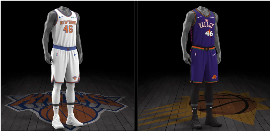
KNICKS: ASSOCIATION EDITION