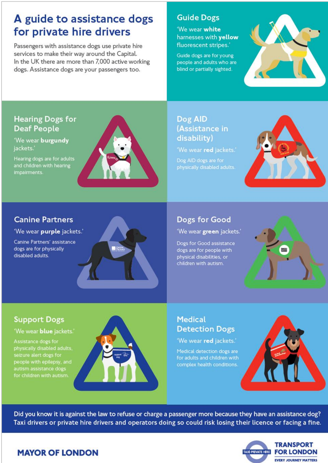
Figure 2: TfL poster on assistance dogs in private hire services

The experience on the ground can be very distressing for some of our clients who book a [minicab]... The call goes out from the office, the driver turns up and in quite a few cases you will get the driver saying, "I do not take dogs". You will find that that is a lucky outcome. Sometimes the driver will spot the dog from afar and just drive off, abandoning the guide dog owner by the side of the road, which has happened quite frequently. 30