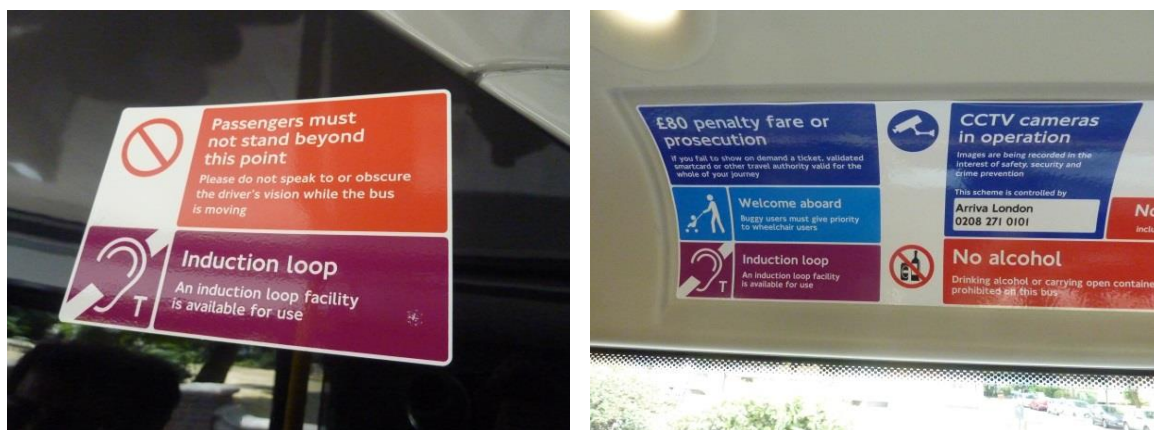
Figure 3: Hearing loop information on London buses

Dr Roger Wicks of Action on Hearing Loss told the Committee of a number of issues with bus hearing loops that hearing impaired passengers may experience: