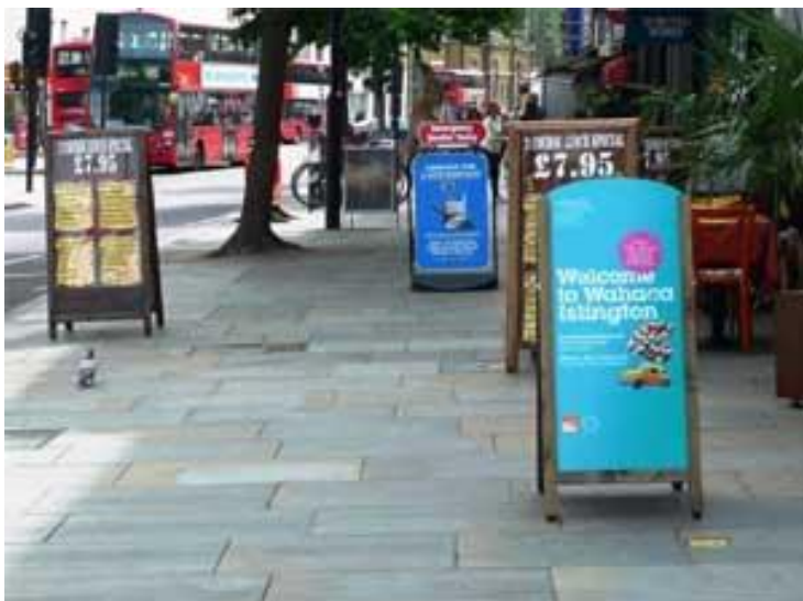
Figure 5: Advertising boards on Upper Street, Islington

It is the duty of TfL and the local highway authority to keep their footways clear and they have the powers to do so. Only a very small number of local highway authorities do this, as they should. Some defend the right of traders to clutter the streets with free-standing advertising boards [see Figure 5 below]. TfL acknowledges this issue and is starting to enforce against those that obstruct the pavement. 43