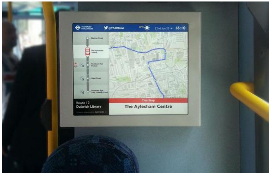
Figure 1: Experimental passenger information screens on buses 9

Also, TfL is continuing to trial passenger information screens on two route 12 buses, showing real time route maps and next stop information using GPS, as shown in Figure 1 below. We look forward to seeing the evaluation of this project.