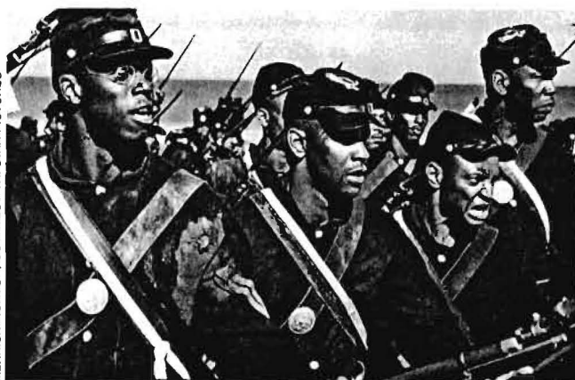
Left: The men of Matthew Broderick's 54th Massachusetts on Jekyll Island. Below: Union troops move on reconstructed Fort Wagner at dusk.

S pecial effects abounded during the Wagner shoot. The fort's big guns were equipped with a hydraulic piston system designed to make them recoil from their simu-