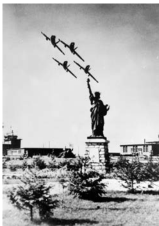
Statue dedication ceremony, Chaumont Air Base, 4 July 1956

Not long after the wing proudly took on the title of The Statue of Liberty Wing, the wing’s comptroller discovered the factory that had produced the actual Statue of Liberty was only 25 miles from Chaumont. In fact, one of the actual molds still existed. The factory agreed to cast a three-meter replica of the statue for $1,700. The wing raised the funds by raffling off a 1956 French Ford Versailles sedan. The statue still stands in