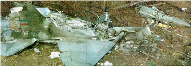
Remains of a MiG-29, courtesy of the 493d FS

During the air war over Serbia, the wing deployed 1,011 personnel to 18 different locations. The wing's pilots and aircraft flew combat missions from three locations, using 69 aircraft. Those remaining at RAF Lakenheath not only made up for the work of those deployed, but also launched combat missions. Furthermore, they served as a supply point for their deployed counterparts, sending 3,871 tons of equipment to various locations. In all, the pilots of the 48th serving under expeditionary squadrons flew 2,562 sorties for more than 11,000 combat hours in less than three months, dropping approximately 3 million pounds of munitions and scoring four out of five confirmed Air Force aerial victories.