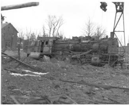
Remains of a German locomotive

Almost immediately after their arrival, members of the 48th began a rigorous training program, flying dive-bombing, glide bombing, night flying, low-level navigation, smoke laying, reconnaissance, and patrol convoy sorties. Over the next two months, the number of sorties steadily increased and the group flew its first combat missions on 20 April 1944—an uneventful fighter sweep of the occupied French coast. The group and squadrons underwent another name change on 30 May 1944, dropping the designation “bomber.” The names that would remain with the units until their inactivations were the 48th Fighter Group and the 492d, 493d, and 494th Fighter Squadrons.