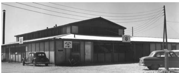
Chaumont Air Base Post Exchange Building, 1955

The new 48th Fighter-Bomber Wing inherited a base that was little more than acres of mud where wheat fields used to be. The only hardened facilities were a concrete runway and a handful of tarpaper shacks. Within two years, the wing headed up an engineering project that resulted in the construction of permanent barracks, a wing headquarters, flightline shops, and warehouses.