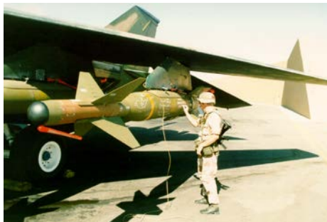
Greetings from the 48 TFW