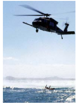
HH-60 water rescue

Mission changes since the mid-2000s also dictated organizational changes. In 2006, the 56th Rescue Squadron was assigned to the 48 FW after the closure of the NATO base at Keflavik, Iceland. The rescue mission evolved during this time as well as combat rescue officers, pararescuemen and survival, evasion, resistance, and escape specialists were formed into their own Guardian Angel squadrons, separate from the flying squadrons. In February 2015, this was realized at Lakenheath with the activation of the 57th Rescue Squadron. In January 2015, the DoD also announced that two squadrons of the new F-35A Lightning II would be assigned to the 48 FW beginning in 2020.