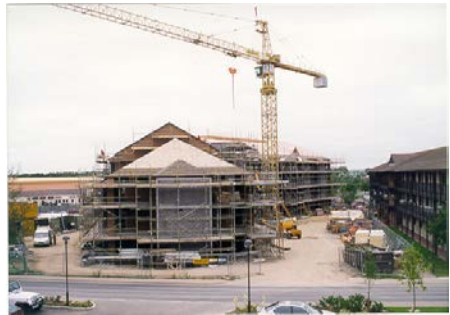
A one-plus-one dormitory under construction in the 1990s

Throughout the 1990s, the 48th Fighter Wing worked to replace its deteriorating World War II facilities and upgrade the flying and maintenance areas for the F-15E Strike Eagles it received in 1992 and the F-15C/D Eagles in 1994. Another major goal was to improve "Quality of Life" facilities, with new "one-plus-one" single-bedroom dormitories, renovated housing units, and improved recreational facilities.