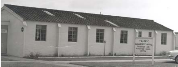
The new Traffic Management Office, ca. 1960

On 8 December 1957, the 48th Fighter-Bomber Group inactivated and its operational units assigned directly to the wing. The wing underwent another major organizational change on 8 July 1958 when in conjunction with an Air