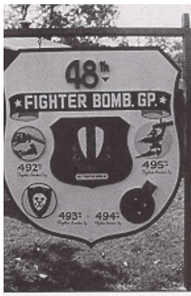
World War II Headquarters Sign

On 21 March 1944, the men of the 48th Fighter-Bomber Group boarded the Queen Mary , bound for an unknown and uncertain service in