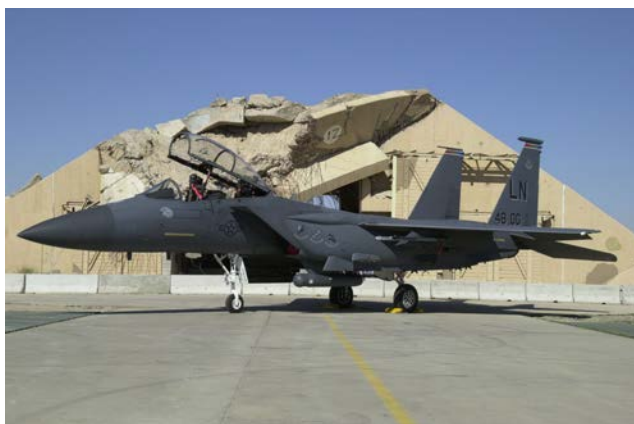
F-15E at Ahmed Al Jaber Air Base, Kuwait.

With this mission change, the 493d Fighter Squadron inactivated on 1 January 1993, only to activate again on 1 January 1994.