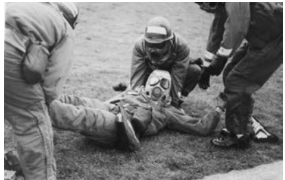
Exercise participants aid an injured airman after an attack, 1970s

As early as the summer of 1975, the 48th Fighter Wing began its preparations to receive the F-111 Aardvark . The first public, official announcement took place in October 1976. In a three-way move, the 48th received F-111s from the 366th Tactical Fighter Wing, Mountain Home Air Force Base, Idaho; the 366th received F-111s from Nellis Air Force Base, Nevada; and Nellis received Lakenheath's F-4s.