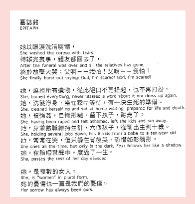
Mali Wu Epitaph installation and details (1997)

own experience as a survivor (especially female) of the tragedy.