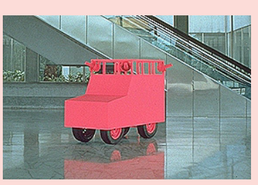
Mali Wu Pink News (1994)

The silver one with a shape borrowed from a Mercedes-Benz model was called Proletarian Car; the golden one called Pink News (Sex Scandal), whose name was inspired by