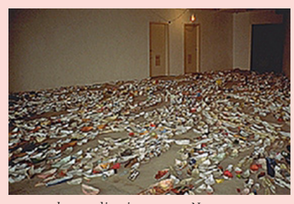
n.paradoxa online issue no.5 Nov 1997

In Collective Dreams , for example, which was part of the Out of the White Space activity during the Hong Kong Art Festival in February 1996, this work actively emphasised the relationship between society, environment and the masses. It reminded me of the close relation between boats and Hong Kong. Boats could be the