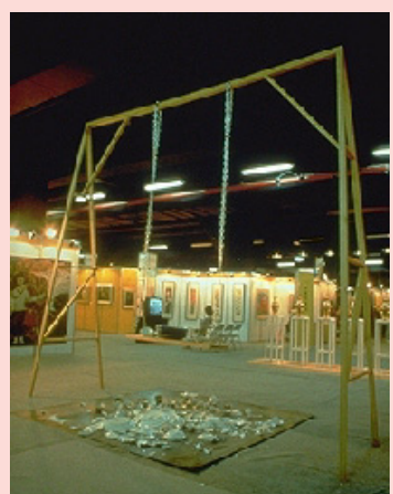
Mali Wu Swing Art Fair, Taipei 1992

Political themes come to the fore in some of Wu's later works such as Asia, a huge maze with a red centre created in 1989 for an exhibition in Japan. Regional politics blend with gender politics in the literally startling installation