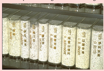
Mali Wu detail of Library (1995) n.paradoxa online issue no.5 Nov 1997

The quiet reading room of Gnawing Text , Reaming Words in fact contains echoes