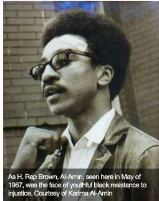
As H. Rap Brown, Al-Amin, seen here in May of 1967, was the face of youthful black resistance to injustice.

His voice had power. His booming delivery was infused with rousing socio-political rhetoric. With a rhythmic cadence, tone, and inflection, his voice kept a beat. It emboldened a generation of black youth, and frightened the white establishment. His voice organized black voters in rural southern towns. It later pushed drug dealers and prostitutes out of his Atlanta community. As he aged, the provocative rhetoric gave way to a mellow, measured and direct recital of religious discipline. He traded his iconic black beret and black sunglasses for a knitted kufi and wire-rimmed glasses. Despite his garb, at a lean 6'5", he always cut an imposing figure – a revolutionary unafraid to speak truth to power.