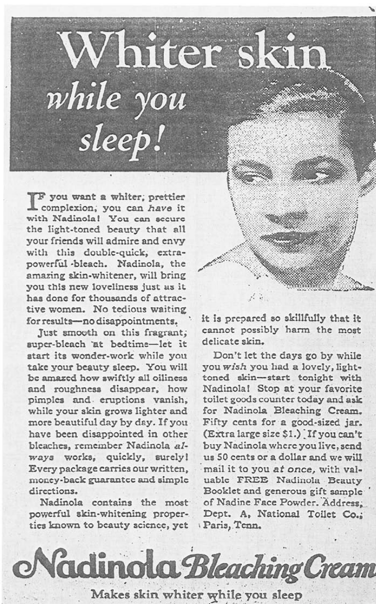
Figure 1: Advertisement for Nadinola Bleaching Cream, The New York Amsterdam News (August 14, 1929): 4.