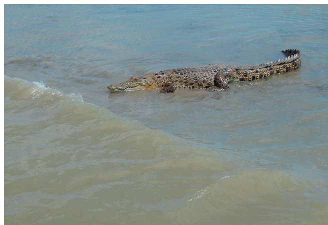
Figure 10. Crocodylus porosus in tidal, coastal habitat.

The C. porosus population in Sabah has recovered significantly over the last 20 years due to: legal protection (since 1982); a decline in the timber industry which decreased habitat/river disturbance; siltation leading to the alteration of downstream river habitats; stabilization of oil palm estates and secondary growth along river banks; opening of closed canopy swamp and riverine forest; the El Niño-Southern Oscillation episode