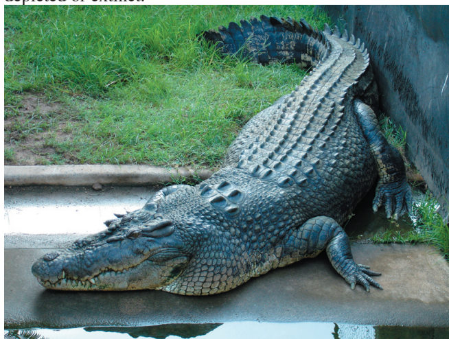
Figure 13. Captive breeding based on C. porosus is carried out in many Range States where the wild populations are depleted.

added to significantly through ranching programs (eggs, hatchlings and/or juveniles) in Indonesia, Papua New Guinea and Australia. Ranching is not possible in much of the former range of C. porosus because wild populations are severely depleted or extinct.