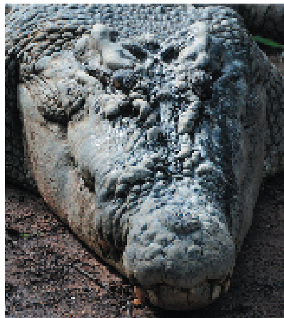
Figure 2. Adult male C. porosus .

Crocodylus porosus is considered the largest of the living crocodylians, with reported lengths of up to 6-7 m (Webb and Manolis 1989, 2009; Whitaker and Whitaker 2008). Although accounting for far less human fatalities than the Nile crocodile (Caldicott et al. 2005), C. porosus preys on people when given the opportunity. It is one of the most widely distributed of all crocodylians, ranging from southern India and Sri Lanka, throughout southeast Asia, east through the Philippines to Micronesia, and down through Indonesia, Papua New Guinea and the Solomon Islands to northern Australia.