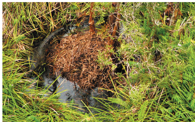
Figure 7. Female C. porosus at nest.

to increase even in rivers where numbers have stabilized (Fukuda et al. 2011). The total population in the Northern Territory is considered to be approaching pre-exploitation levels (Webb et al. 2000; Letnic 2004). A sustainable use program based on ranching of wild eggs forms the basis of management (see Leach et al. 2009), combined with a program of problem crocodile removal (Letnic 2004; Nichols and Letnic 2008), a limited wild harvest by landowners, and public education to reduce HCC (Letnic 2004). Six farms are currently in operation in the Northern Territory (PWSNT 2005). The degree to which introduced cane toads ( Bufo marinus ) have impacted on C. porosus is unknown, but is not generally considered significant.