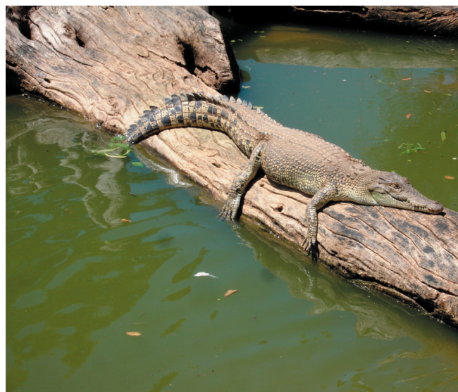
Figure 12. Juvenile C. porosus .

The Palau program also focuses on ‘problem’ crocodile complaints and public awareness, with 21 problem crocodiles reported between 2005 and 2008, mostly from the north of the country (Joshua Eberdong, pers. comm. 2009). Despite concerns about the genetic integrity of C. porosus in Palau due to past importation of different crocodile species ( C. novaeguineae , C. mindorensis , Alligator mississippiensis ; Brazaitis et al. 2009), an analysis of 39 blood samples from wild C. porosus confirmed no hybridization (Russello et al. 2007). A CSG review in 2005 highlighted the fact that crocodiles are not currently protected by law, and that the public generally “dislike” them, and consider them pests (Anon 2006a). At times crocodiles are killed and eaten as food. A few adult C. porosus are maintained in Koror, and some captive-bred hatchlings have been released back into the wild. A management recovery plan is being drafted with assistance from the US Fish and Wildlife Service.