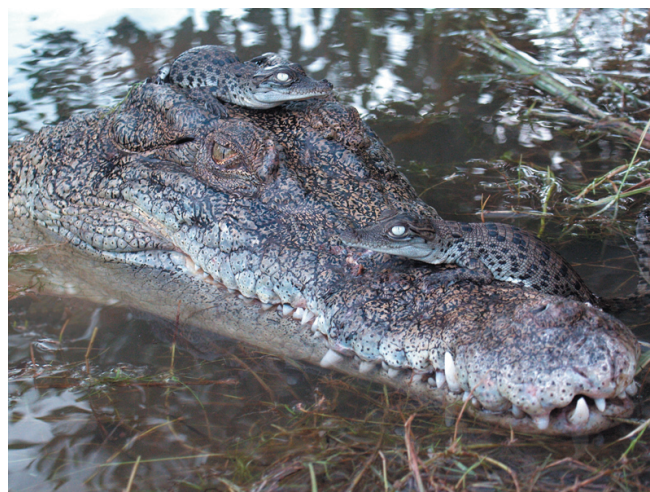
Figure 11. Female C. porosus with hatchlings.

of 1997-98 which reduced flooding of nests and led to high recruitment that year; and, a dramatic decline in the harvest of wild crocodiles for skins during the late 1990s due to both lower prices and the implementation of CITES (Stuebing et al. 2002).