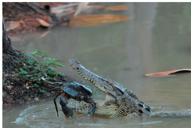
Figure 6. Mud-crabs are a common food item for C. porosus in tidal, saline areas.

Female C. porosus mature at around 2.2-2.5 m (12+ years of age in the wild). They lay their eggs in a mound of vegetation during the annual wet season (October-May; Webb et al. 1977, 1983). Mean clutch size in Australia is around 50 eggs at 113 g per egg (Webb et al. 1983), whereas in Papua New Guinea it is around 60 eggs at 100 g per egg (Cox et al. 2006). Incubation is typically 80-90 days (depending on temperature). As nesting is a wet season activity, loss of nests