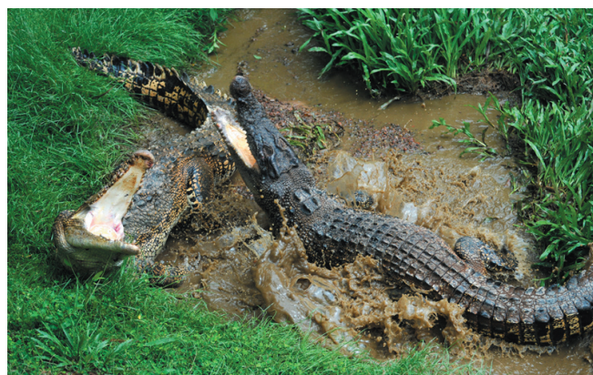
Figure 5. Aggressive social interaction between sub-adult C. porosus .

In the Northern Territory of Australia, the recovery of wild C. porosus populations following protection (1971) was carefully documented, providing new information on population dynamics. Increasing numbers of large crocodiles over time have been accompanied by decreasing numbers of small crocodiles (Webb and Manolis 1992), which are predated or excluded from rivers and sometimes forced into marginal habitats, including upstream freshwater areas used for recreation by people (Letnic and Connors 2006).