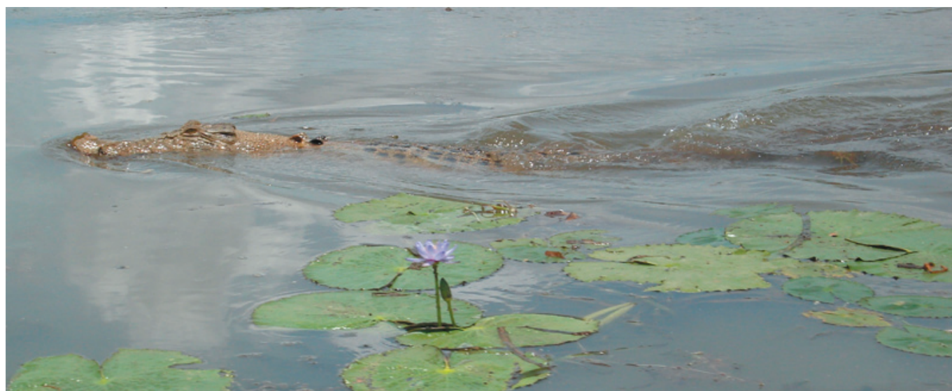
Figure 8. Crocodylus porosus .

China : The presence of C. porosus in southern China remains to be verified. Various farming operations on mainland China and Hainan Island have some C. porosus , imported from Range States such as Thailand (Chen 2001; Geng 2001; Li 2001).