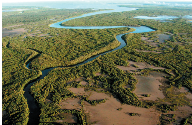
Figure 3. Tidal creek habitat of C. porosus in northern Australia.

A great deal of ecological research was carried out in the 1970s and 1980s, particularly in Australia and Papua New Guinea. Contrary to its common name “Saltwater crocodile”, which implies a marine existence, the species commonly inhabits non-tidal freshwater sections of rivers, and inland freshwater lakes, swamps and marshes. Indeed, it thrives in freshwater environments. In the marine environment it mostly inhabits tidal rivers and creeks, where salinity changes with different seasons and distance upstream, but they regularly move around the coast between rivers and occupy offshore islands.