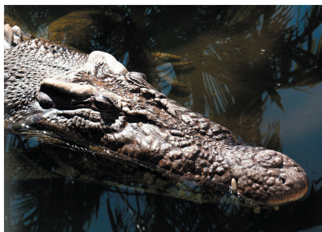
Figure 9. Crocodylus porosus .

Indonesia : An extensive survey program was conducted by FAO and the CITES Management Authority (PHKA - Direktorat Jenderal Perlindungan Hutan dan Konservasi Alam) in the 1990s, but it did not provide an estimate of the total population of C. porosus within Indonesia, nor its distribution across the archipelago nation. The stronghold for C. porosus is Papua Province, particularly the Mamberano River drainage in the north. Past human exploitation and habitat alteration have reduced the population of C. porosus