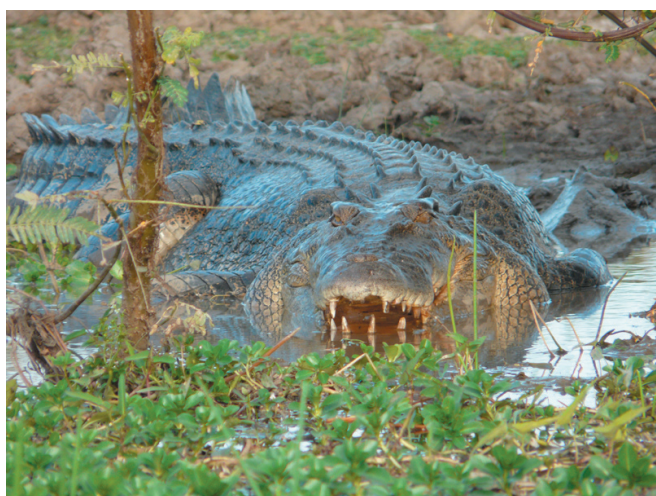
Figure 4. Adult male C. porosus , Arnhem Land.

Long-distance voyages at sea occur (Allen 1974; Manolis 2005) with unknown frequency (eg Cox 1985; Jelden 1985; Webb et al. 1984, 1987; Messel and Vorlicek 1989; Webb and Manolis 1989, 2009). Some of the highest densities of C. porosus have been reported from heavily vegetated freshwater swamps without any tidal influence (Webb et al. 1977, 1984). Breeding and recruitment take place principally in rivers with significant freshwater input, or in freshwater swamps (Jelden 1981; Webb et al. 1983; Cox 1985).