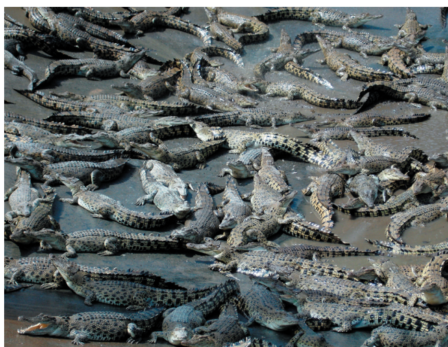
Figure 14. Sustainable use programs have created positive incentives for the conservation of C. porosus .

As a species, the global population of C. porosus is secure, because of large populations, extensive habitat and effective management in Australia, Papua New Guinea and to a lesser degree Indonesia. There are increasing C. porosus populations in the Solomon Islands, Sarawak and Sabah, due to effective protection measures, and management may require incentives derived from sustainable use to counter negative public attitudes towards them. Reintroduction and protection efforts in Bhitarkanika National Park, India, have been successful to the point that increasing HCC is being reported. Re-establishment of large populations in India outside protected areas may never be possible due to the large human population and lack of suitable habitats. Likewise, re-