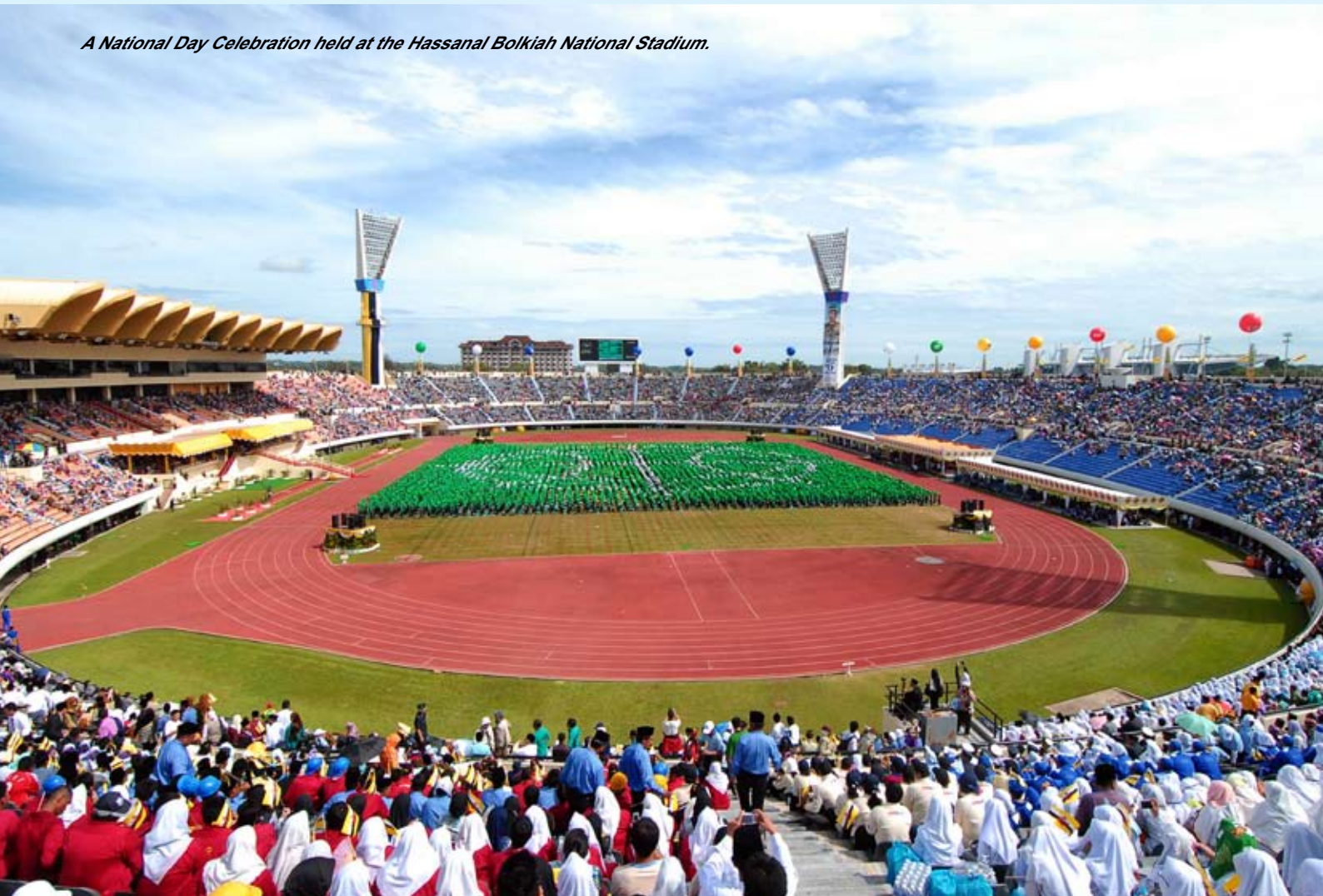
A National Day Celebration held at the Hassanal Bolkiah National Stadium.

The stadium can accommodate up to 25,000 spectators including royal seats, VIP seats and grandstand seats.