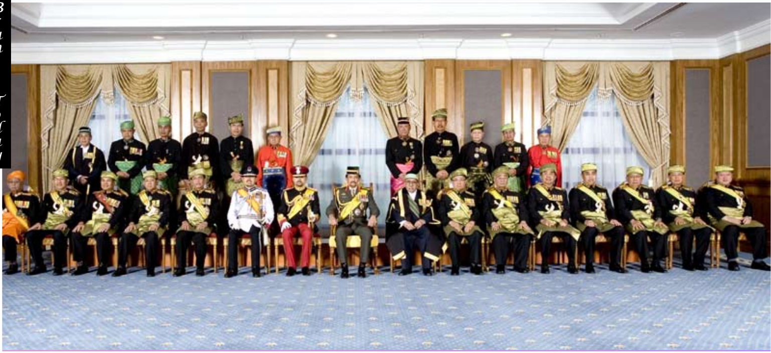
Members of State Legislative Council in group photo.