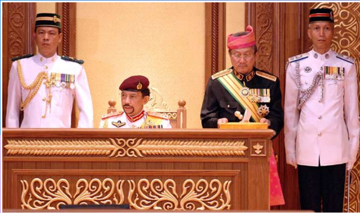
His Majesty The Sultan and Yang Di-Pertuan of Brunei Darussalam delivering a royal speech at the opening of a session of the State Legislative Council.