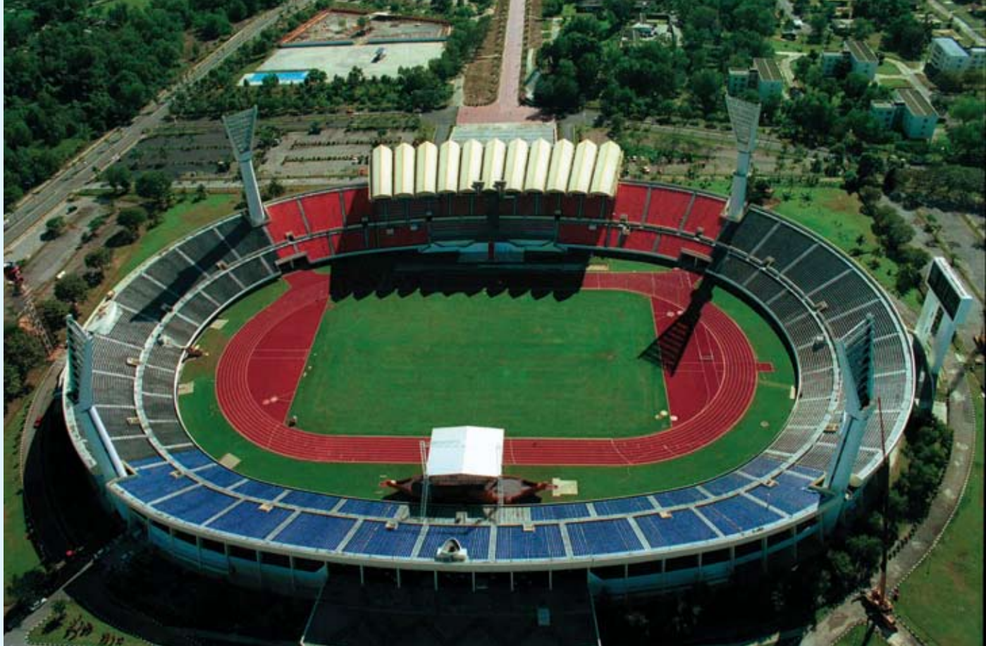
An aerial view of the Hassanal Bolkiah National Stadium.

The football field was made according to Federation Internationale de Football Association (FIFA) standards.