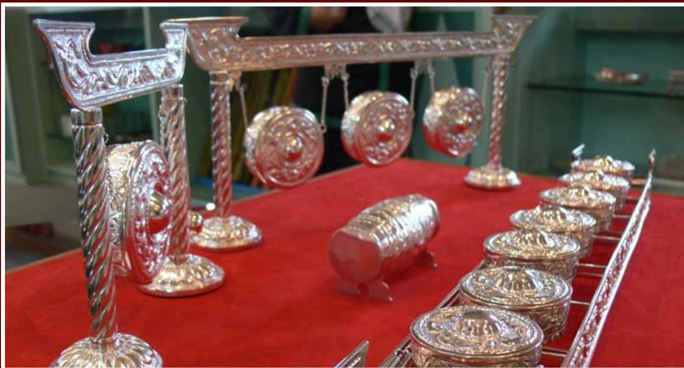
A replica of Brunei's traditional musical instrument, guling tangan in silver.