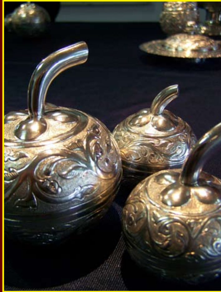
Traditional methods in silversmithing are still practiced today producing beautiful and detailed ornaments.