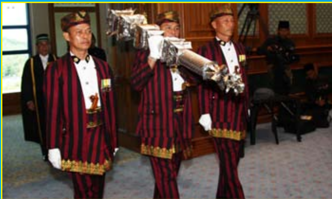
* From page 8 (State Legislative Council Building)

columns, stairs and symmetry that display Order, Strength and Stability.