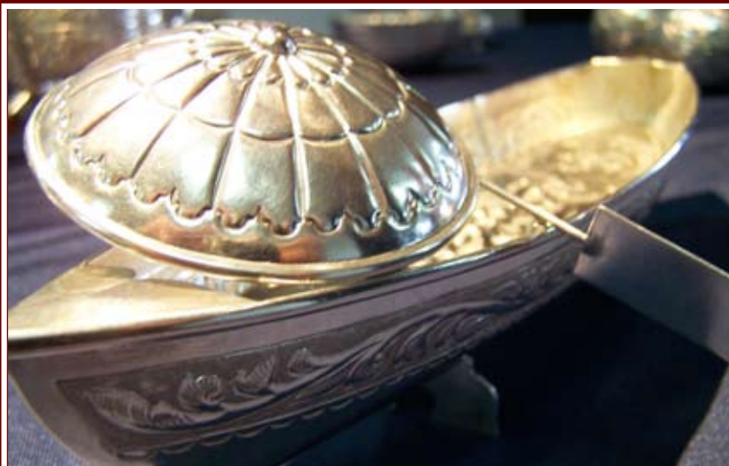
Various shapes and sizes with multi purposes made with silver.