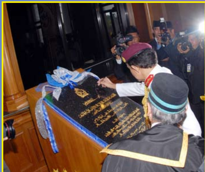
His Majesty The Sultan and Yang Di-Pertuan of Brunei Darussalam signs a commemorative plaque to officially opened the State Legislative Council Building.

Brunei Darussalam reopened its State Legislative Council in September 2004, where the seatings took place at the International Convention Centre (ICC) before moving permanently to the current building.