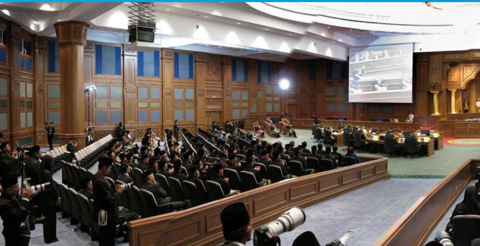
A wide angle view of the State Legislative Council Meeting in session.