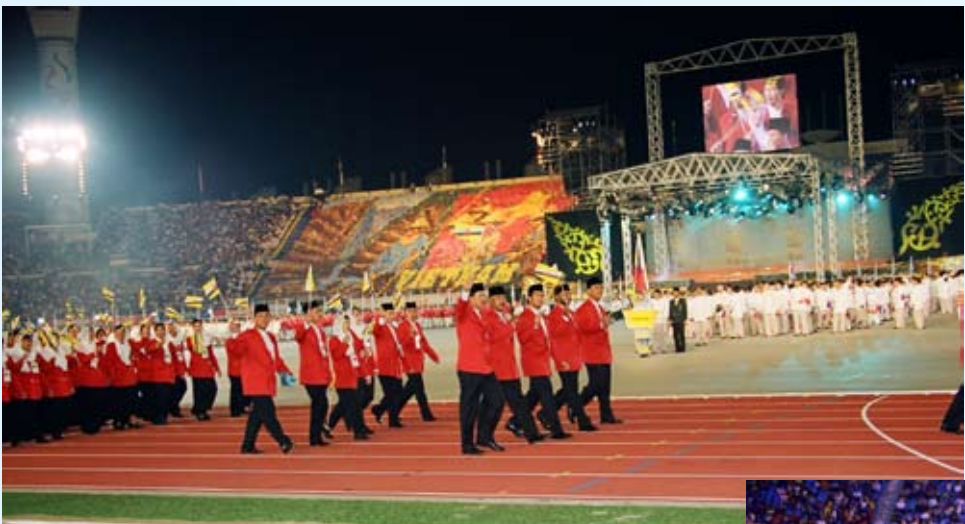
One of the highest prestigious events held at the national stadium was the 20 th Southeast Asia Games (SEAGames) in 1999.