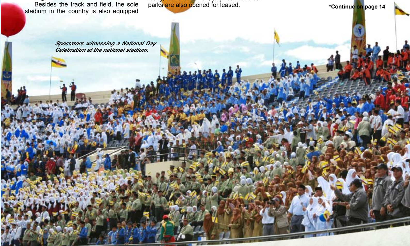
Spectators witnessing a National Day Celebration at the national stadium.