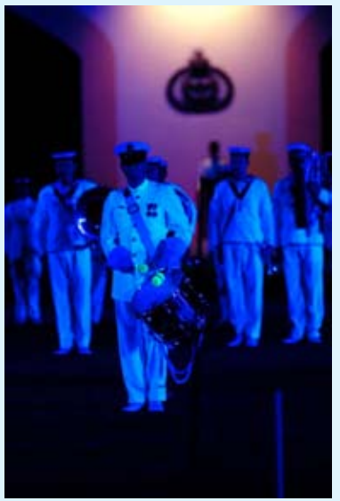
Various celebrations hosted at the national stadium.