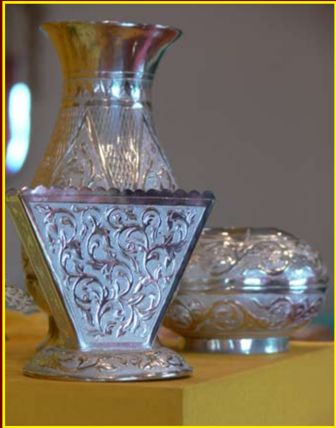
The value of handicraft produced through silversmithing can reach to thousands of dollars.