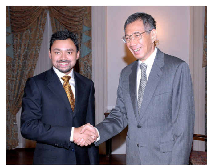
His Royal Highness with the Prime Minister of Singapore, His Excellency Lee Hsien Loong during courtesy call.