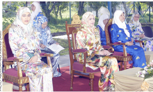
Her Royal Highness at the launching of Girl Guides 'Development Project' in Berakas.

This took place at its headquarters where the planting