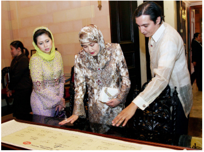
Her Majesty The Raja Isteri and Her Royal Highness Pengiran Isteri visit Library of Malacanang Palace.