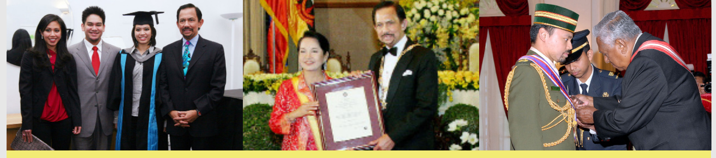
7 Her Royal Highness graduates

8 His Majesty receives `Order of Lakandula'