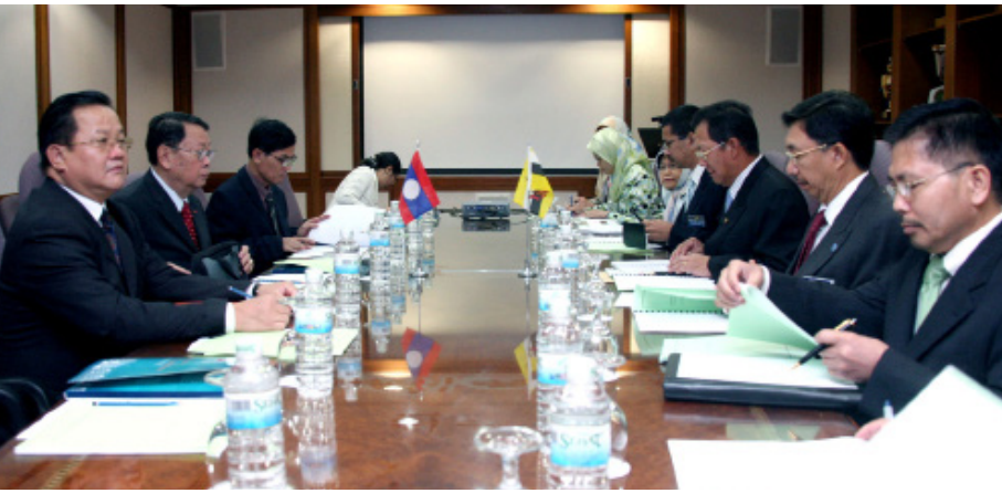
Bilateral meeting between Ministry of Health Brunei Darussalam and Laos.

The visit aimed to explore cooperation and to increase field of networking besides enhance relationship between the two ministries. The Laos's Minister of Health is in the country for two days starting from January 19 to 20.