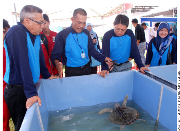
Minister of Industry and Primary Resources, Pehin Dato Haji Awang Yahya looking closely at the breaded turtle.

The Fishery Carnival is a four-day event participated by 70