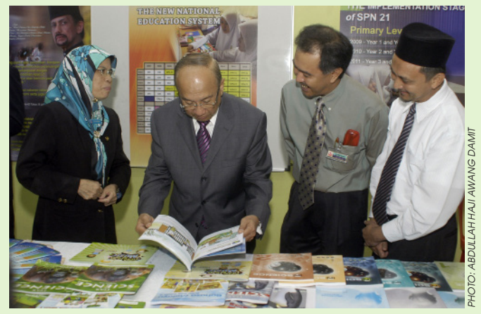
Minister of Education (second from left) browsing one of the books on SPN 21.