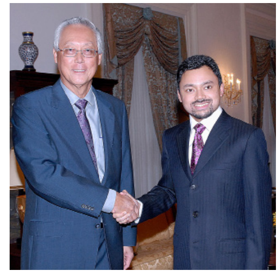
His Royal Highness with His Excellency Goh Chok Tong, Senior Minister of Singapore.