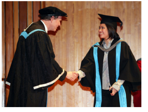
Her Royal Highness receives her Msc with honours in International Relations from the Faculty of Arts Social Sciences at Barbican Centre in London.

A total of 435 graduates received their degrees in various courses during the graduation ceremony.