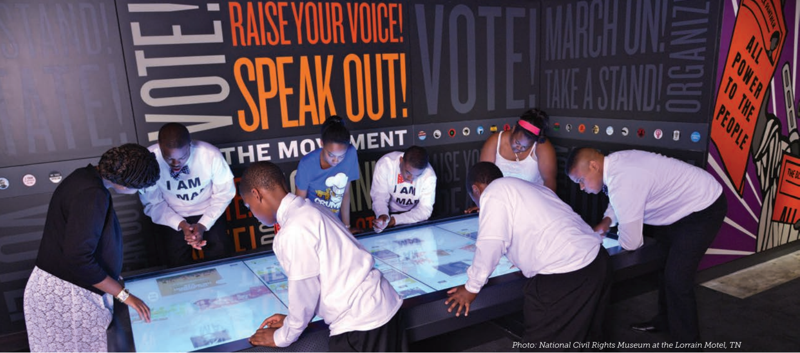
Photo: National Civil Rights Museum at the Lorraine Motel, TN