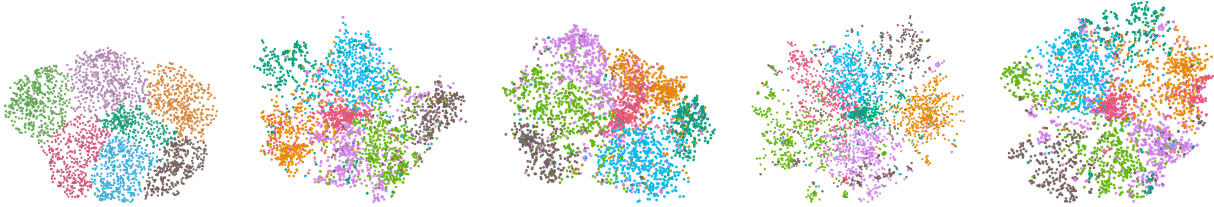
Figure 3: The Cora data visualization comparison. From left to right: embeddings from our ARGGA, VGAE, GAE, DeepWalk, and Spectral Clustering. The different colors represent different groups.