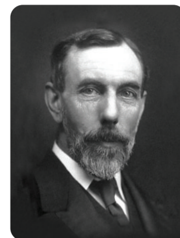
Sir William Ramsay

At this point, the Government recommended to the Provisional Committee that a well-known European scientist be invited to give final shape to the project. And for this mission, the committee chose Sir William Ramsay, the famous British chemist. Ramsay submitted a detailed report to the Government of India in early 1901 about the university (he called it the Indian Institute of Research ) which he believed should be in Bangalore.