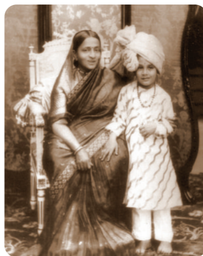
Regent Queen Vani Vilasa Sannidhana with her son, Maharaja Krishnarajendra Wadiyar

By then, the Dewan of Mysore State Seshadri Iyer offered land and additional money on behalf of the Durbar for setting up the university in Bangalore. Iyer was the advisor to the Regent Queen Vani Vilasa Sannidhana, who ruled the State on behalf of her son Krishnarajendra Wadiyar, then still a minor.