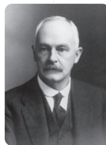
David Orme Masson