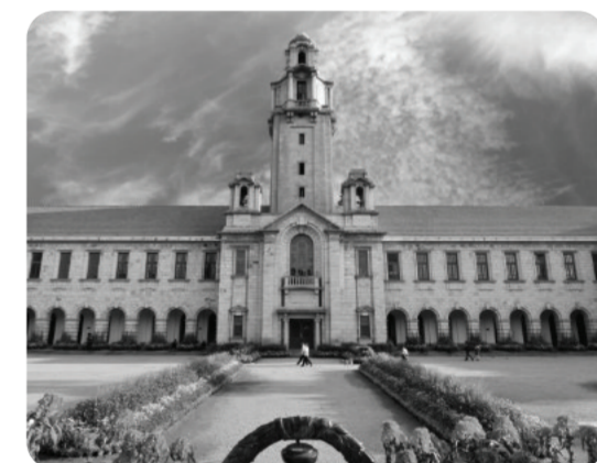
Main Building of IISc

Tata unfortunately died in May 1904 well before IISc was established. After several delays following his death, the Government finally passed on a vesting order on 27 May 1909, officially creating IISc. It came up in Bangalore on the 371 acres of land gifted by the Mysore Durbar, which also provided Rs. 5 lakh towards capital expenditure and Rs. 50,000 annually. Money for the remaining annual expenses came from Tata's endowment (Rs 1.25 lakh per year) and the Government (Rs 87,500 per year).