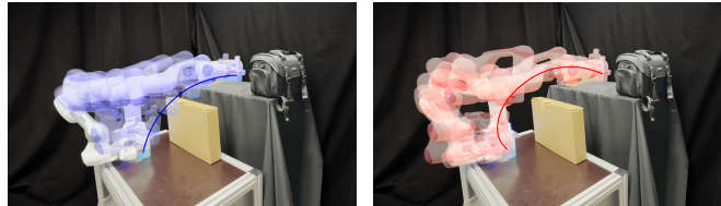
Fig. 1: Execution of motions in the real-world Panda Shelf environment. The motion in blue and red start and end at the same configurations, but it is possible to see two modes resulting from sampling trajectories with MPD. This environment includes obstacles (represented as boxes in the digital twin), which are not present in the environment used for training (Fig. 2d).

This work was funded by the German Federal Ministry of Education and Research project IKIDA (01IS20045), and by the German Research Foundation project METRIC4IMITATION (PE 2315/11-1). 1 Intelligent Autonomous Systems Lab, TU Darmstadt, Germany; 2 German Research Center for AI (DFKI); 3 Hessian.AI; 4 Centre for Cognitive Science