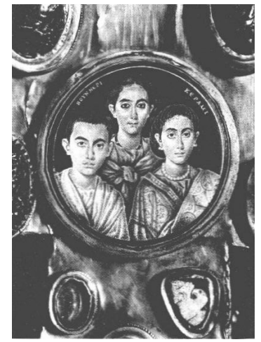
The early church was anything but a refuge for slaves and the impoverished masses, as illustrated by this portrait (ca. 300) of the Christian Galla Placidia and her children, done in gold leaf on glass.

For Most of the twentieth century historians and sociologists agreed that, in its formative days, Christianity was a movement of the dispossessed—a haven for Rome's slaves and impoverished masses. Friedrich Engels was an early proponent. claiming that "Christianity was originally a movement of oppressed people: it first appeared as the religion of slaves and emancipated slaves, of poor people deprived of all rights, of peoples subjugated or dispersed by Rome" (Marx and Engels 1967:316). These views seem to have first gained ascendancy among