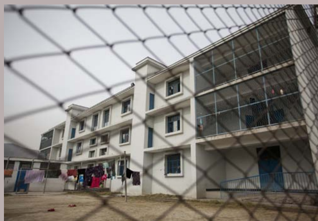
(Above) Kabul's Badam Bagh, meaning "Almond Garden," is the largest women's prison in Afghanistan. About 70 women were being held there for "moral crimes" when Human Rights Watch visited in October and November 2011.