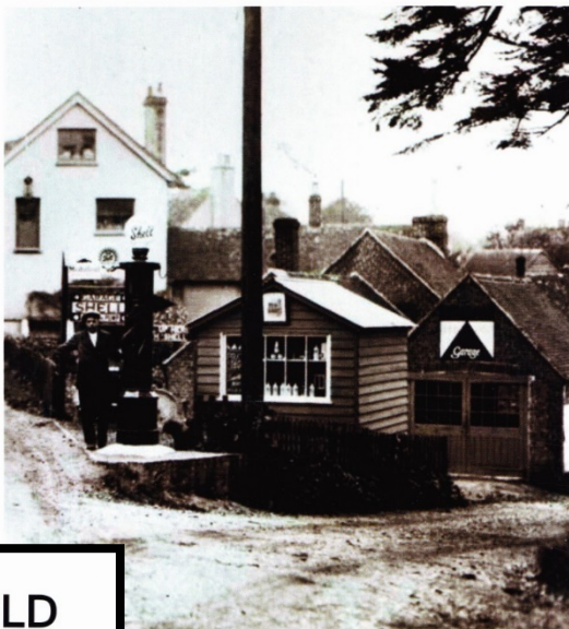
G, BOREHAM STREET, WINDMILL HILL, AND BODLE STREET GREEN