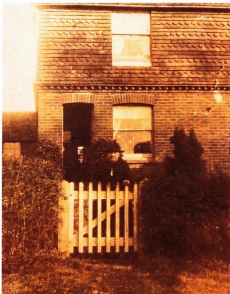
HERSTMONCEUX, COWBEECH, MAGHAM DOWN, AND WINDMILL HILL

Available from our usual outlets: Herstmonceux Post Office and Windmill Hill Stores, and Lime Cross Nursery (who stock most of our books)