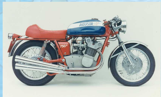
MV 750 Sport 4C75 - 1972

Cylinders / Cycle: 4 / 4 stroke Displacement: 742.9 cc Bore x stroke: 65 x 56 mm x 4 Compression ratio: 9.5:1 Power / rpm: 69 HP / 7900 Torque / rpm: 5.8 kgm / 7500 Cooling: air Distribution: double overhead cam Carburettor: 24 mm carburettor x 4 Ignition: distributor Lubrication: wet sump Starting: electric Primary drive: gear Clutch: wet multiple plate clutch Gearbox: 5 speeds Final drive: shaft