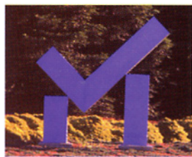
"VARI-L SERIES I" (1993*) 12' 7" H x 9' 6" W x 7' 2" D