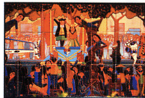
Details of two ceramic panels