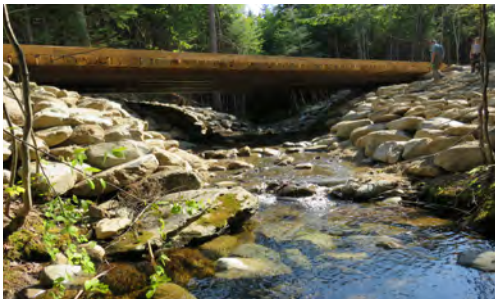
J. Wright, USFWS

Undersized road culverts obstruct fish passage and threaten public safety with accelerated flows, erosion, and flooding. In Maine, the Appalachian Mountain Club, NRCS, and the Coastal Program are working together to replace undersized culverts with bridges, using EQIP assistance provided by NRCS. Located in a private non-industrial forest, these photographs show the undersized culvert (left) and the new bridge (right) over a brook trout tributary to the Penobscot River.