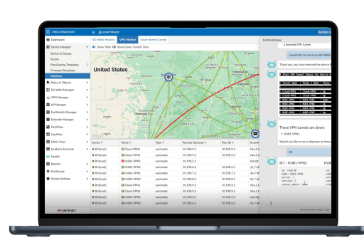
GenAI in FortiManager helps manage networks effortlessly—generate configuration and policy scripts, troubleshoot issues, and execute recommended actions.

FortiGate Cloud is a SaaS service offering simplified management, security analytics, and reporting for Fortinet FortiGate NGFWs to help you more efficiently manage your devices and reduce cyber risk. It simplifies the initial deployment, setup, and ongoing management of FortiGates and downstream connected devices such as FortiAP, FortiSwitch, and FortiExtender, with zero-touch provisioning. It provides real-time and historical visibility into traffic analytics and security threats to reduce risks and improve security posture. View various threats, web traffic, and system events stored in the cloud for up to a year, with predefined reports to meet compliance and deliver actionable insights.