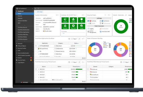
Comprehensive view of network performance, security, and system status