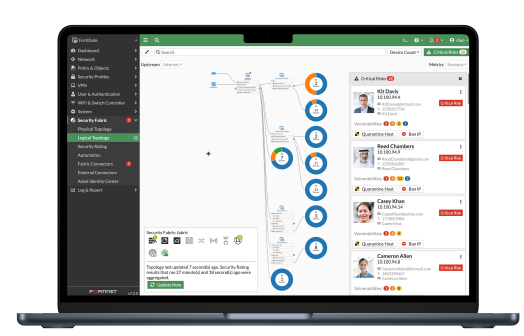
Intuitive easy to use view into the network and endpoint vulnerabilities

Learn more about what's new in FortiOS. https://www.fortinet.com/products/fortigate/fortios