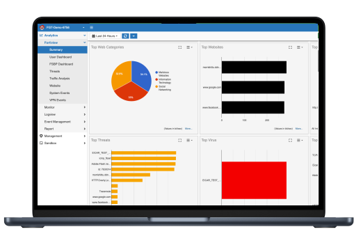
FortiGate Cloud provides intuitive management and analytics solution with end-to-end visibility, logging and reporting for SMB.