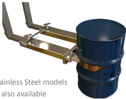
Stainless Steel models also available

Our best selling drum handler has a fully automatic action. The attachment has two curved arms which hinge at one end. To lift a drum, approach it with the clamp arms horizontal and positioned halfway up the drum, between two rolling hoops. When the arms contact the drum they will open automatically, falling back around the drum as you proceed forwards. When the attachment is raised the arms will grip the drum tightly under the upper rolling hoop.