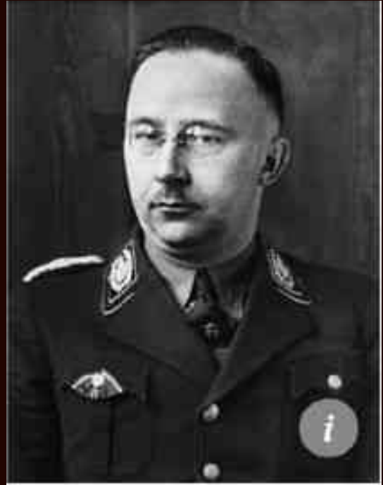
SS Chief Heinrich Himmler

“What’s the connection between German soldiers and Indonesian musicians? We, the Indonesian people, didn’t kill millions of Jewish people, right?”