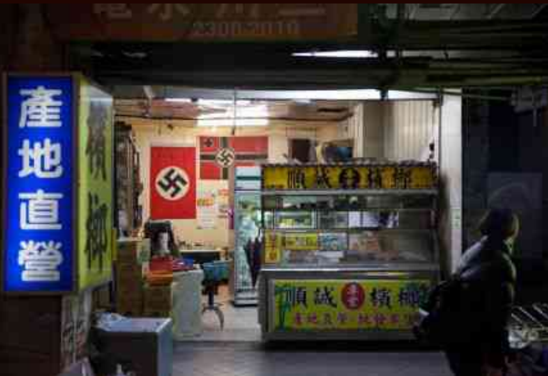
Taipei Nut Shop