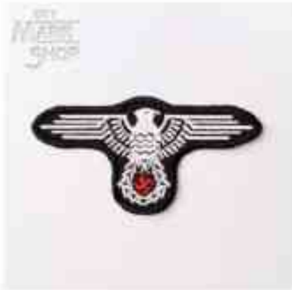
유니버설 : 미7나치