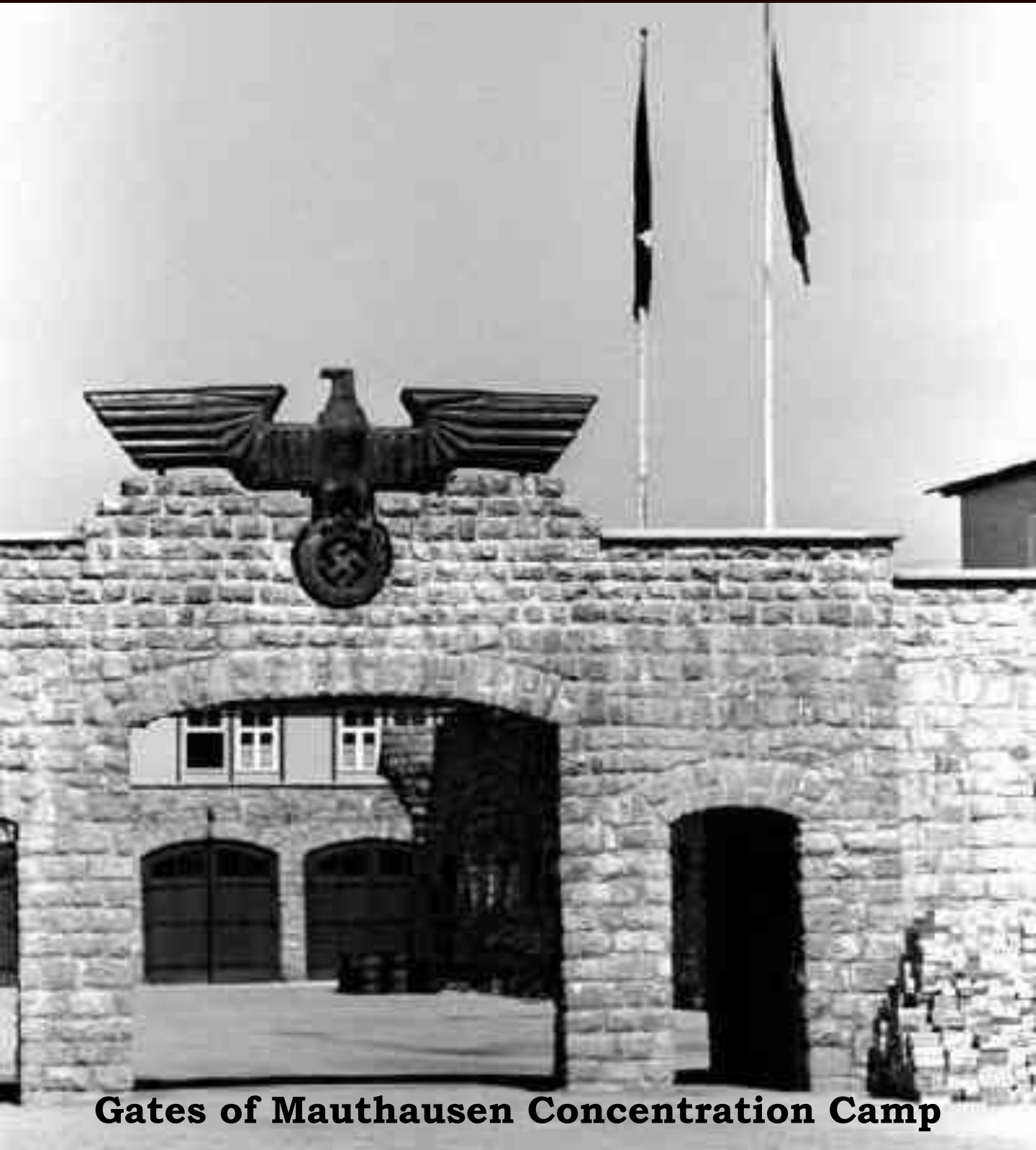
Gates of Mauthausen Concentration Camp