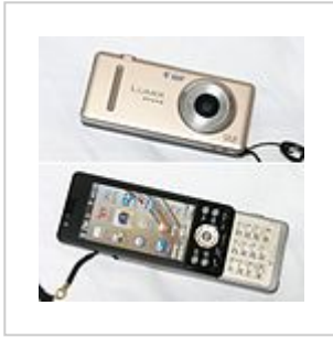
SoftBank 001P by Lumix