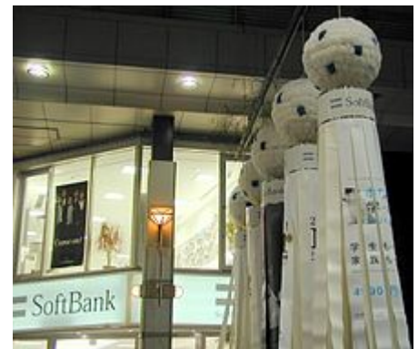
SoftBank store in Sendai, with decorations for the Tanabata

In July 2015, SoftBank announced the renaming of the company from SoftBank Corp. to SoftBank Group Corp. Meanwhile, SoftBank Mobile was renamed to SoftBank Corp., the now former name of the company as a whole. [28] On 16 February 2016, SoftBank announced they would repurchase a record 14.2% of shares, valued at $4.4bn, in order to boost investor confidence. [29] On 31 March 2016, they announced they would sell shares worth $7.9 billion of their stake in Alibaba Group . On 21 June 2016, SoftBank sold its 84% stake in Supercell for reported US$7.3 billion to Tencent . [30] On 3 June 2016, Softbank agreed to sell most of its stake in GungHo Online Entertainment (approximately 23.47%) for about $685 million, which would thus end Softbank's majority ownership of the company, resulting in Gungho no longer being an associate of Softbank. [31][32][33] The offer was accepted by Gungho and completed by 22 June, thus allowing Gungho to become an independent company. [34][35]