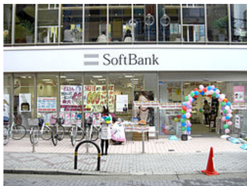
SoftBank store in Ibaraki, Osaka, Japan

In 2000, SoftBank made its most successful investment ever – $20 million to a then fledgling Chinese Internet venture Alibaba. [13] This investment turned into $60 billion when Alibaba went public in September 2014. [14][15]