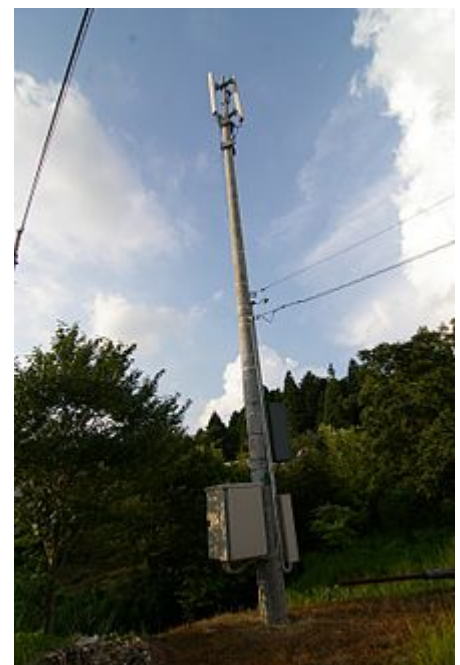
A SoftBank mobile cell tower in Nakatsugawa, Gifu