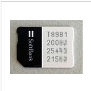
A SoftBank USIM card