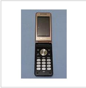
SoftBank 821SH PG