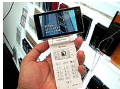
Television broadcast on a 2007 Sharp phone on SoftBank