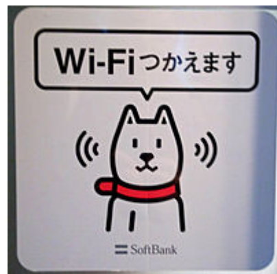
SoftBank Wi-Fi display with the company's mascot, indicating a place where Wi-Fi can be used