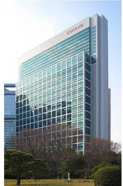
Tokyo Shiodome Building, SoftBank's global headquarters in Tokyo.