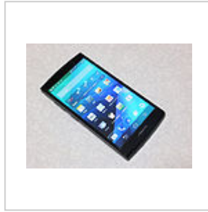
SoftBank A202F by ARROWS