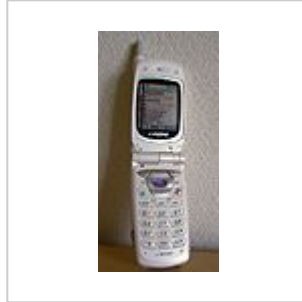
J-PHONE J-SH07 by Sharp (2001)