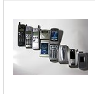
An evolution of J-PHONE and Vodafone cell phones, 1997–2004