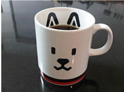
Merchandise drinking mug featuring "Otosan", the SoftBank mascot

On 3 October 2012, the take over of competitor eAccess was announced, and was completed in January 2013. [20] On 1 July 2013, SoftBank announced that Willcom became a wholly owned subsidiary effective 1 July 2013, after termination of rehabilitation proceedings. eAccess was merged with Willcom, which resulted in a new subsidiary and brand from Yahoo! Japan , Ymobile Corporation .