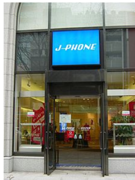
J-PHONE store in Nagoya in 2003

However, in January 2005, Vodafone Japan lost 58,700 customers and in February 2005 lost 53,200 customers, while competitors NTT DoCoMo gained 184,400 customers, au by KDDI gained 163,700, and Willcom gained 35,000. While as of February 2005, DoCoMo's FOMA 3G service had attracted 10 million subscribers and KDDI's 3G service had attracted over 17 million subscribers, Vodafone's 3G service only attracted 527,300 subscribers. Vodafone 3G failed to attract