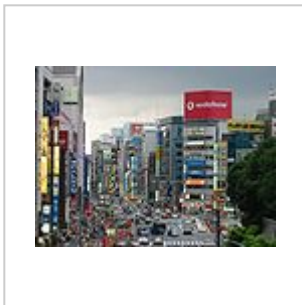
View of Taitō , Tokyo, with a large Vodafone sign in the background (2004)