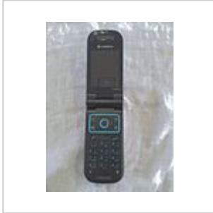
Vodafone 803T by Toshiba