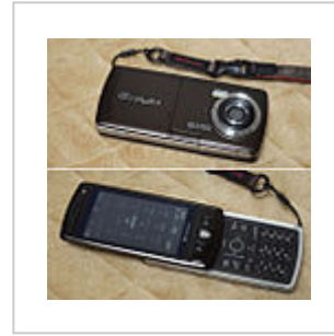
SoftBank 930CA by EXLIM