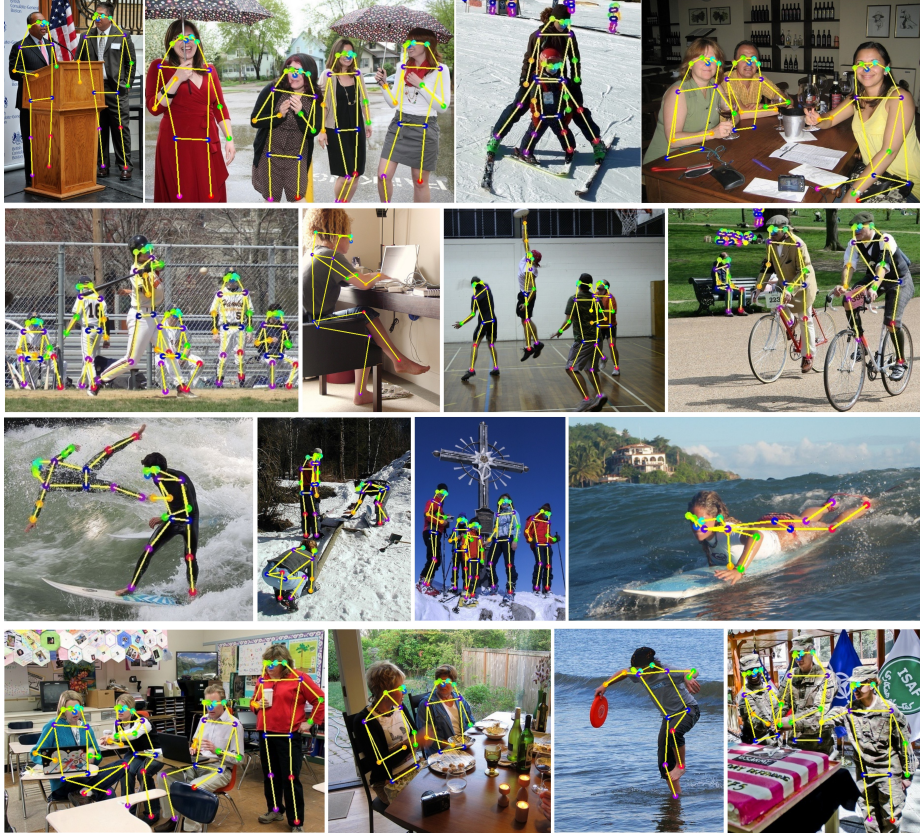
Fig. 5. Examples of estimated poses on the COCO test set.