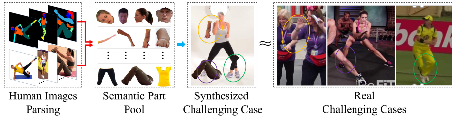
Fig. 2. Illustration of Semantic Data Augmentation (SDA). We first apply human parsing on training images and get a large amount of segmented body parts. The segmented body parts are organized, according to their semantics, to build semantic part pool. For each training image, several part patches will be randomly sampled and properly placed on the image to synthesize the real challenging cases such as symmetric appearance (green circle), occlusion (purple circle) and nearby person (yellow circle).

transformations, local pixel patch manipulation provide more degrees of freedom to augment image and is able to synthesize the challenging case realistically.