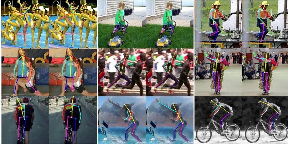
Fig. 4. Comparisons of the HRNet [23] trained without (left side) and with (right side) our Adversarial Semantic Data Augmentation.

in \{rows.1, cols. 1\} is an extremely challenging case so that few of the keypoints are correctly predicted by the original HRNet. By generating tailored semantic augmentation for each input image, our ASDA largely improves the performance of the original HRNet in the extremely challenging cases. Figure 5 shows some pose estimation results obtained by our approach on the COCO test dataset.